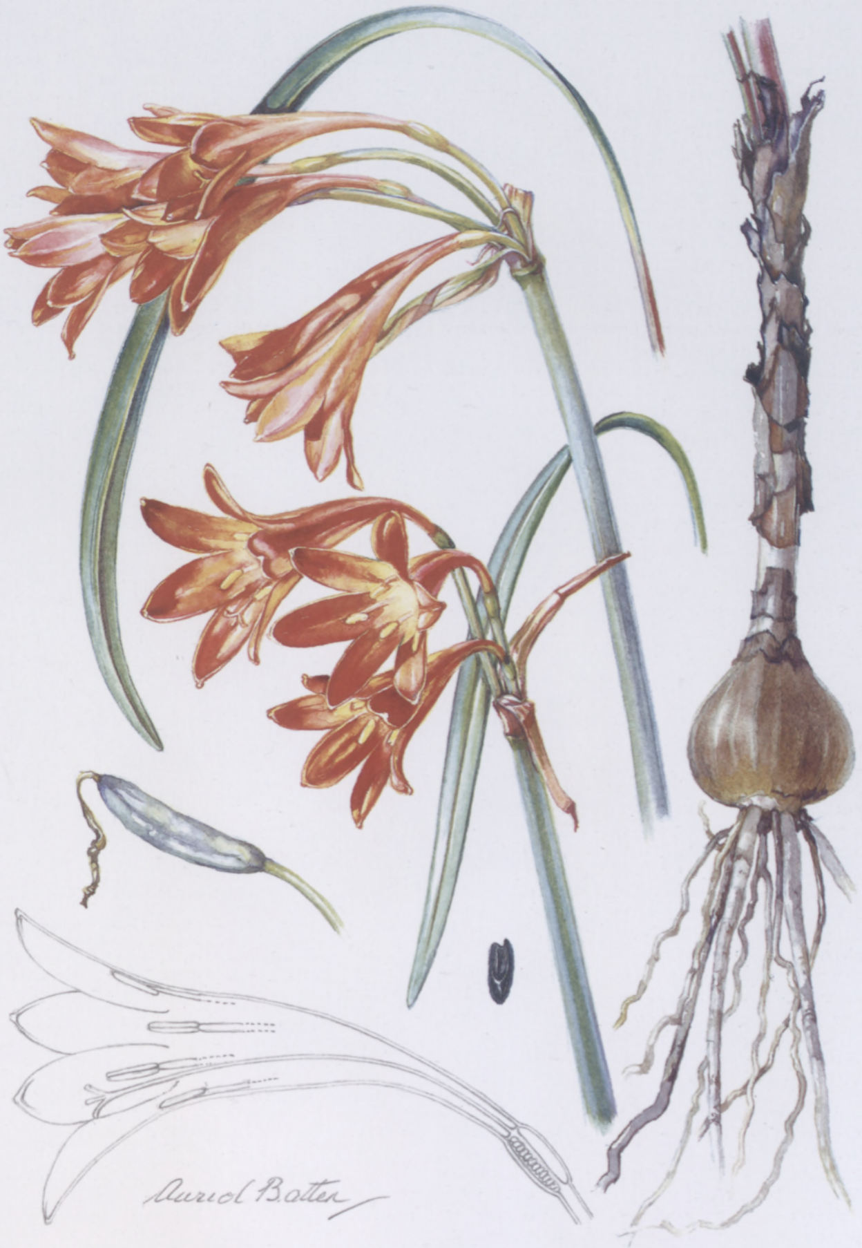
FIGURE 2.— Cyrtanthus macmasteri , \times 1 . A, bulb; B, mature leaves; C, inflorescences; D, 1/s flower; E, capsule; F, seed. Painted from McMaster NBG192330 collected at Farm Keibolo (NBG). Artist: Auriol Batten.