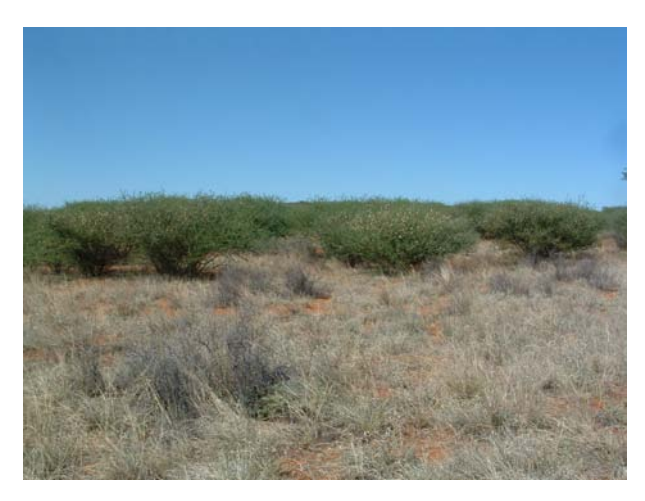
5. Acacia mellifera Shrubland