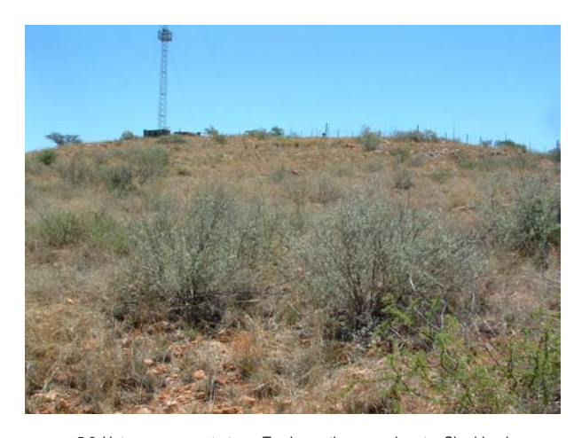
5.3 Heteropogon contortus – Tarchonanthus camphoratus Shrubland Benchmark type: relevè 44