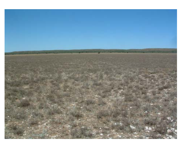
7. Pentzia globosa – Eragrostis truncata Forbland Benchmark type: relevè 52