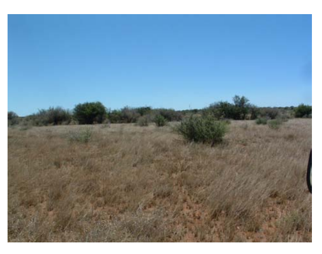
3.2 Ziziphus mucronata – Tarchonanthus camphoratus Shrubland Benchmark type: relevè 57

soil surface were recorded in the relevès of this community. The dominant soil forms are Hutton and Clovelly, but the Mispah form can also occur. This Grassland is associated with the Ah Land Type.