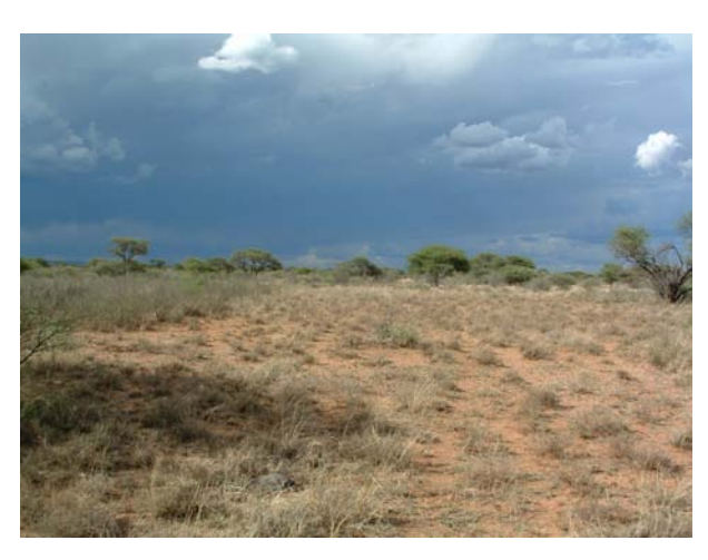
Acacia mellifera – Acacia tortilis Shrubland Benchmark type: relevè 105