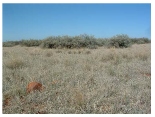
3.1 Eragrostis lehmanniana – Tarchonanthus camphoratus Shrubland Benchmark type: relevè 23

8.1 Salsola rabieana – Eragrostis bicolor Grassland 8.2 Osteospermum species – Eragrostis bicolor Grassland 9. Cynodon dactylon – Sporobolus ioclados Grassland 10. Scirpus species – Diplachne fusca Grassland