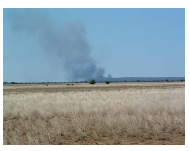
Eragrostis bicolor Grassland Salsola rabieana – Eragrostis bicolor Grassland