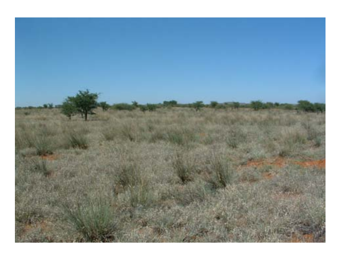
Schmidtia pappophoroides – Acacia erioloba Woodland Benchmark type: relevè 28

The Schmidtia pappophoroides – Themeda triandra Grassland occurs on the plain, mainly in the northern part of the study area (Figure 2) and is strongly associated with deep (> 0.8 m) to moderately deep (0.3–0.8 m) well-drained, yellow-brown or red-brown sandy (clay content < 10%) soil. The community is 2 726 ha in size and is underlain by aeolian sand covering Dwyka tillite. Surface limestone occurs sporadically. No rocks or stones on the