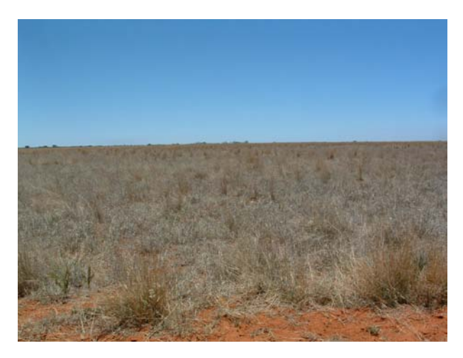
Schmidtia pappophoroides – Themeda triandra Grassland Benchmark type: relevè 22