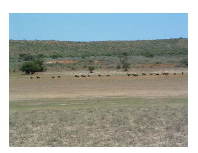
8.2 Osteospermum species – Eragrostis bicolor Grassland Benchmark type: relevè 56