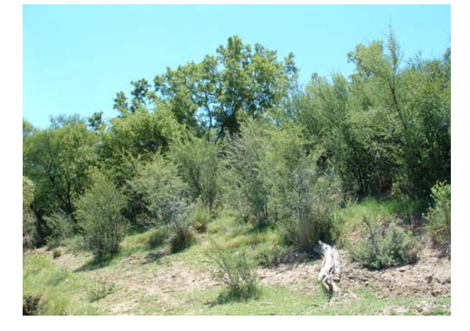
6. Diospyros lycioid es Woodland 6.1 Diospyros lycioid es – Acacia karroo Woodland Benchmark type: relevè 95

stones on the soil surface were recorded in the relevès of this community. The dominant soil forms are Hutton and Clovelly. This Woodland is associated with the Ah and Ae Land Types.