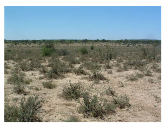
6.2 Salsola rabieana – Diospyros lycioides Shrubland Benchmark type: relevè 34