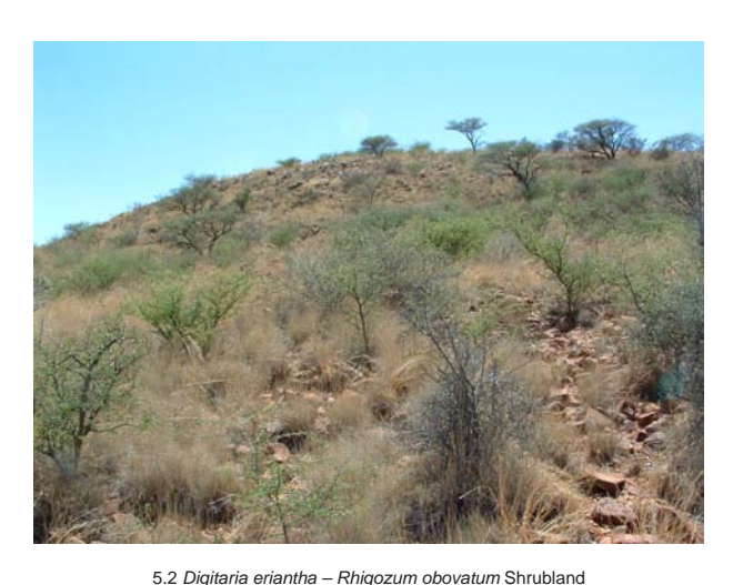
5.2 Digitaria eriantha – Rhigozum obovatum Shrubland Benchmark type: relevè 109