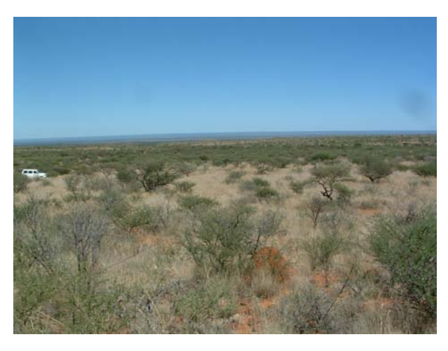
5.1 Tarchonanthus camphoratus – Acacia mellifera Shrubland Benchmark type: relevè 76