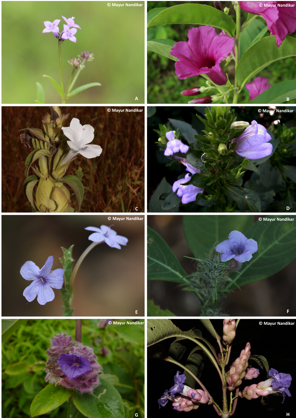
Image 6. A - Neanotis lancifolia ; B - Argyreia cuneata ; C - Barleria sepalosa ; D - Calacanthus grandiflorus ; E - Eranthemum roseum ; F - Haplanthodes verticillatus ; G - Neuracanthus sphaerostachys ; H - Strobilanthes callosus .