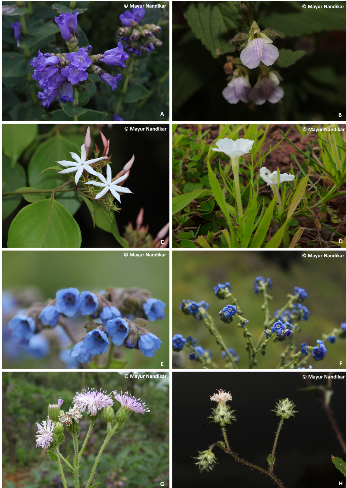
Image 7. A - Strobilanthes sessilis var. ritchiei ; B - Anisomeles heyneana ; C - Jasminum malabaricum ; D - Rhamphicarpa longiflora ; E - Adolocaryum coelestinum ; F - Adolocaryum malabaricum ; G - Adenoon indicum ; H - Baccharoides microcephalum .