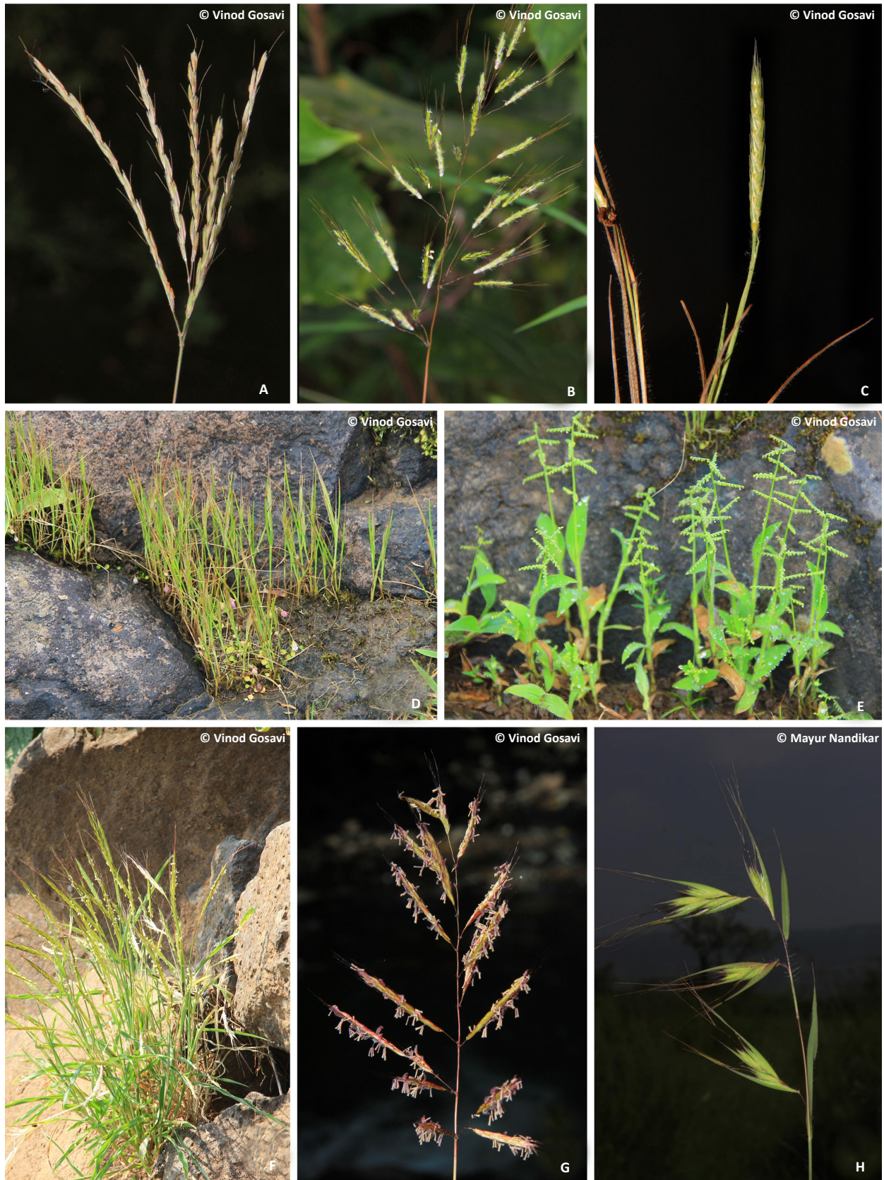
Image 3. A - Arthraxon lanceolatus var. lanceolatus ; B - Capillipedium filiculme ; C - Glyphochloa forficulata ; D - Indopoa paupercula ; E - Paspalum canarae ; F - Ischaemum diplopogon ; G - Spodiopogon rhizophorus ; H - Pseudanthistiria heteroclita .