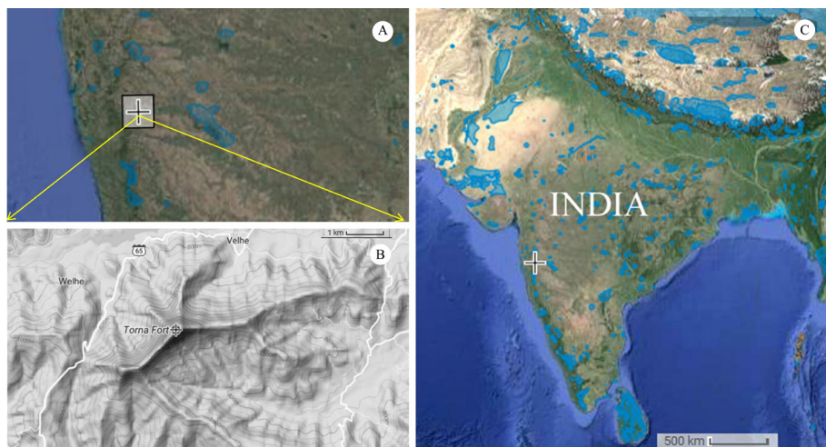
Image 1. Location map of Torna Fort. A - Satellite magnified view from C; B - Terrain view of Torna Fort; C - Satellite view of India '+' denotes the locality 'Torna Fort.'

Our study is an outcome of continuous expeditions to the Torna Fort during 2012–2017. Plant materials were collected during regular field visits at different seasons. Bridson & Forman (1999) have been followed for herbarium preparations. The identity of plants was confirmed with the help of floras (Cooke 1901–1908; Lakshminarasimhan 1996; Singh & Karthikeyan 2000,