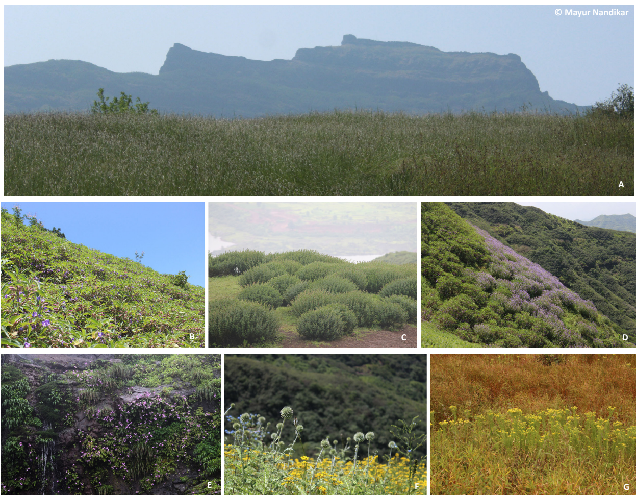
Image 2. A - Main crest of Torna Fort; B - Slopes with mass flowering of Strobilanthes callosus ; C - Plains dominated by Strobilanthes sessilis ; D - Hillslopes with mass flowering of Strobilanthes sessilis ; E - Vertical rocky cliffs; F - Plains with mixed vegetation of Echinops echinatus , Senecio bombayensis and Adelocaryum spp.; G - Plateaus and plains dominated by grasses and Conyza stricta

Torna Fort shows a high degree of variation in habitats and in vegetation patterns. The plateau and plains are covered with grasses, sedges, orchids, scrophulariaceae, legumes and other ephemerals, Strobilanthes , etc. (Image 2 C & G). Vertical rocky cliffs are covered with liverworts, mosses, ferns, balsams, lithophytic grasses, Begonias, Senecio edgeworthii Hook. f., etc. (Image 2E). Vegetation on slopes are dominated by large number of endemic species, viz., Ceropegia sahyadrica Ansari & B.G.P.Kulk., Chlorophytum glaucum Dalzell, Neuracanthus sphaerostachys (Nees) Dalzell, Adenoon indicum Dalzell, Strobilanthes sessilis Nees, S. callosus Nees, Barleria sepalosa C.B. Clarke, Delphinium malabaricum (Huth) Munz, Adelocaryum malabaricum (C.B. Clarke) Brand, Echinops echinatus Roxb., and Thalictrum dalzellii Hook (Image 2B). Rocky crevices