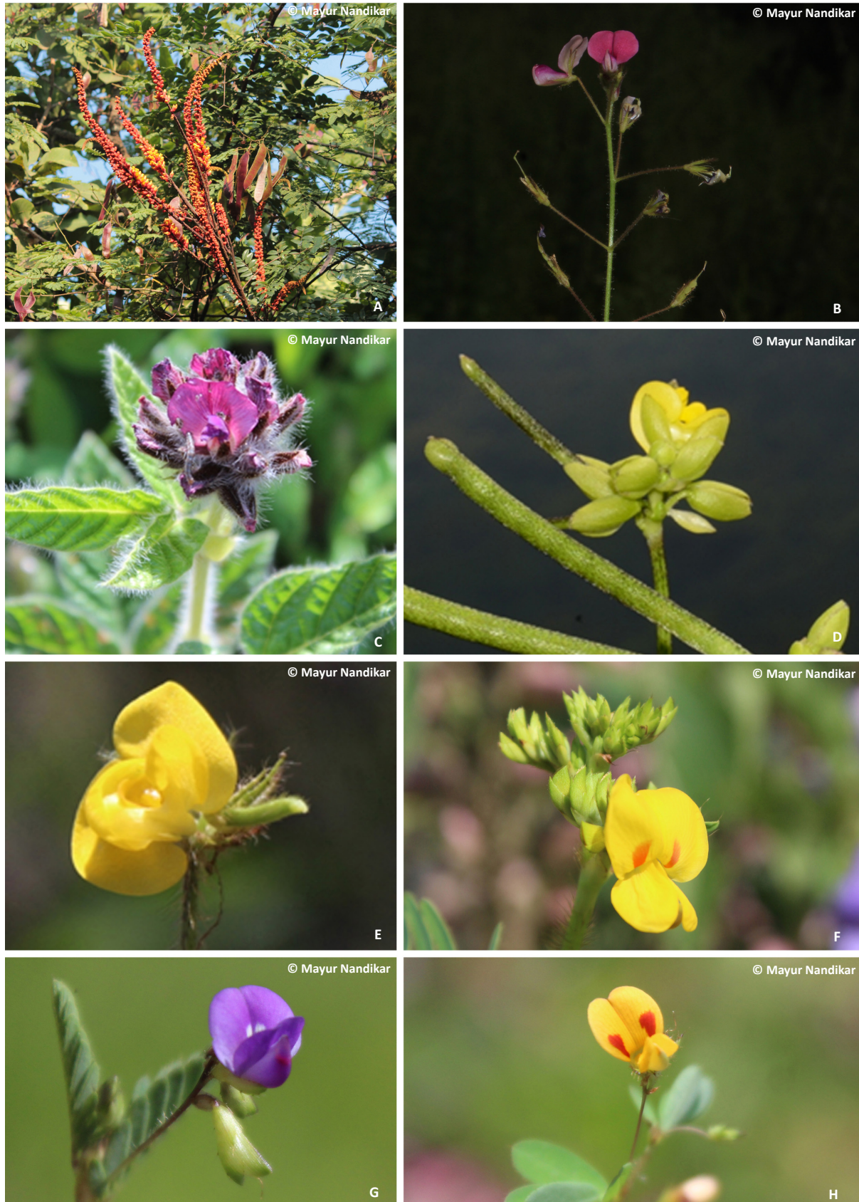
Image 5. A - Moullava spicata ; B - Desmodiastrum belgaumense ; C - Flemingia rollae ; D - Vigna khandalensis ; E - Vigna sahyadriana ; F - Smithia setulosa ; G - Smithia purpurea ; H - Smithia hirsuta .