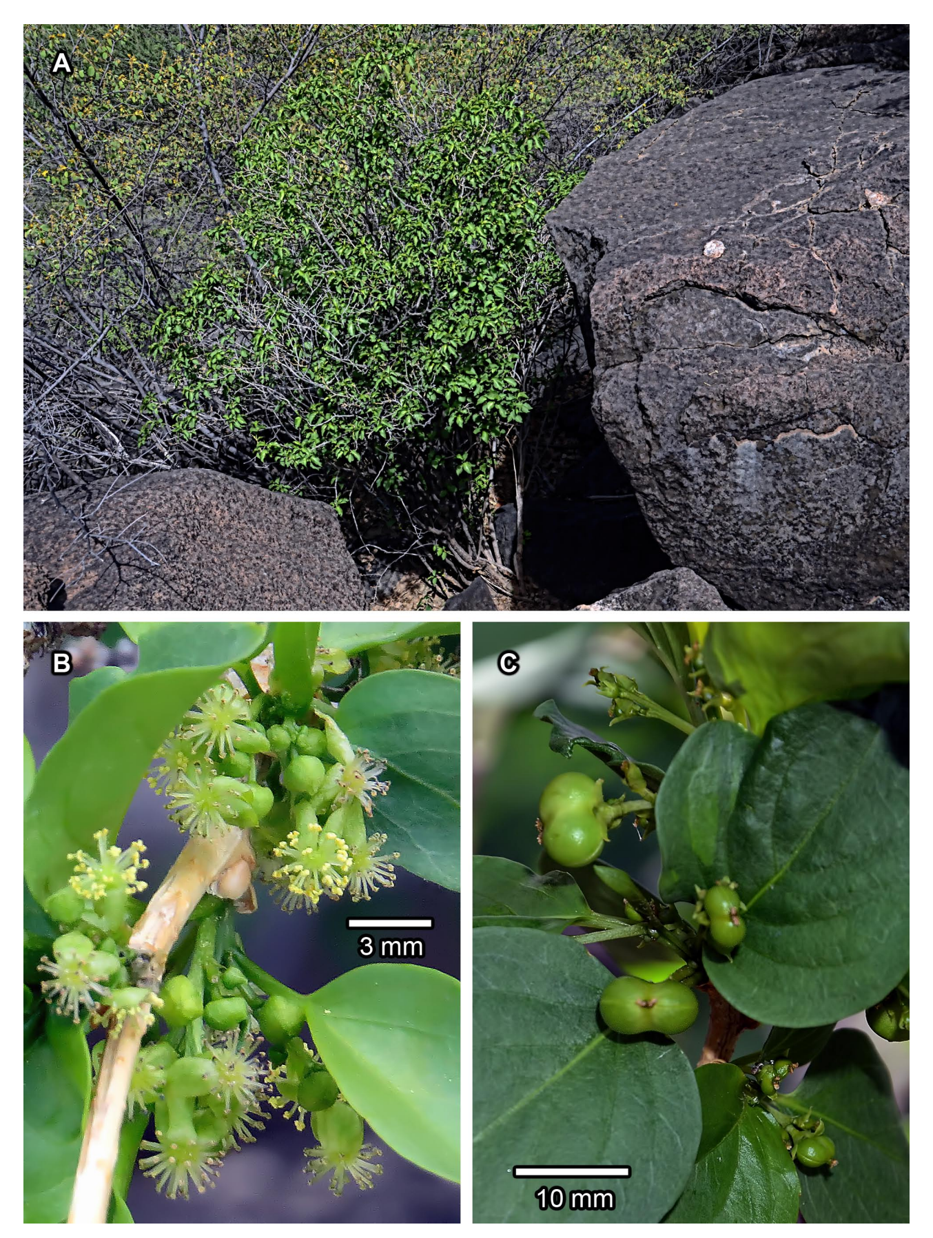
FIGURE 2. Erythrococca kaokoensis. A. Plant in natural habitat (Zebra Mountains, Namibia) among greyish black boulders of anorthosite, growing as a shrub about 2 m tall. Associated shrub with smaller leaves and yellow flowers in background is a species of Grewia . B. Male flowers. C. Female flowers and immature fruit.