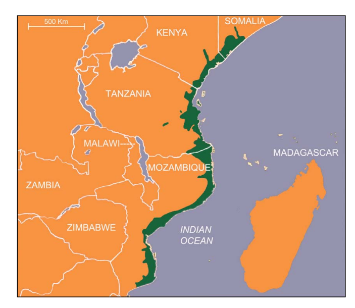
Figure 1 – Area with coastal forests in Eastern Africa (adapted from Burgess et al. 2004b).

More recently, on the basis of species richness and composition, Clarke (1998) has split White's Zanzibar–Inham-