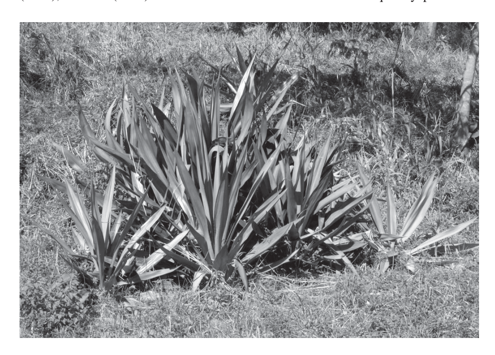
FIGURE 15.—Small colony of Furcraea foetida, Umzimkulu Mouth, KwaZulu-Natal.

Massive, robust, fibrous-rooted multi-annual, monocarpic, leaf succulent. Stem short, ± 1 m high, usually only 200–300 mm long within \pm 2.5–3.5 m diam. basal rosette. Leaves up to 50, rigid, outermost recurving, verdant green to yellow-green, linear-lanceolate to oblanceolate, up to 2 400 \times 200(-250) mm, thick, firm, smooth or obsolescently striate, somewhat roughened beneath, fleshy with thread-like parallel fibres; margins hard and smooth, usually entire at least in distal half, sometimes basally with a few hooked marginal spines shaped like shark's teeth pointing towards the leaf apex, mature apex a firm, blunt point. Inflorescence fast-growing, paniculate; scape 5–12 m high; panicle \pm as long as peduncle, central branches much branched; after flower senescence frequently producing large number of bulbils 10-160 mm long. Flowers with pedicels articulated, 6-12 mm long, in clusters of 2-5, pendulous, only a few open at a time for several weeks, white, greenish white, yellowish green, or pale blue-green, tubular, 25-50 × 10-18 mm, scented. Perianth segments 6, with tepals spreading, 23-30 mm long, oblong, distinct except at base. Stamens 6, inserted; filaments short, abruptly expanded below middle. Ovary inferior, 12-15 mm long; style inserted, dilated, 3-lobed proximal to middle; stigma 3-lobed. Fruits capsular, loculicidally dehiscent, infrequently produced. Seeds many, black, flat, 2 rows