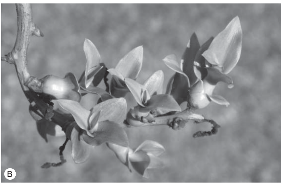
FIGURE 17.— Furcraea foetida: A, mature inflorescence with aerial bulbils; B, aerial bulbils proliferating on a mature inflorescence branch.