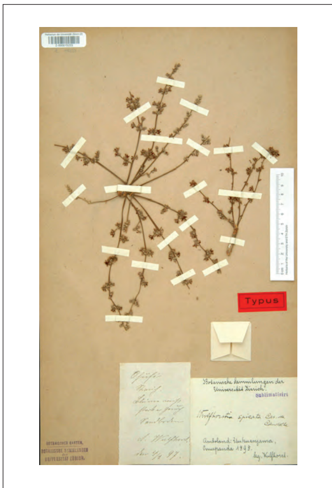
Fig. 2. – Holotype of Wulffhorstia spicata C. DC. (Z000015223), showing original and replacement labels.