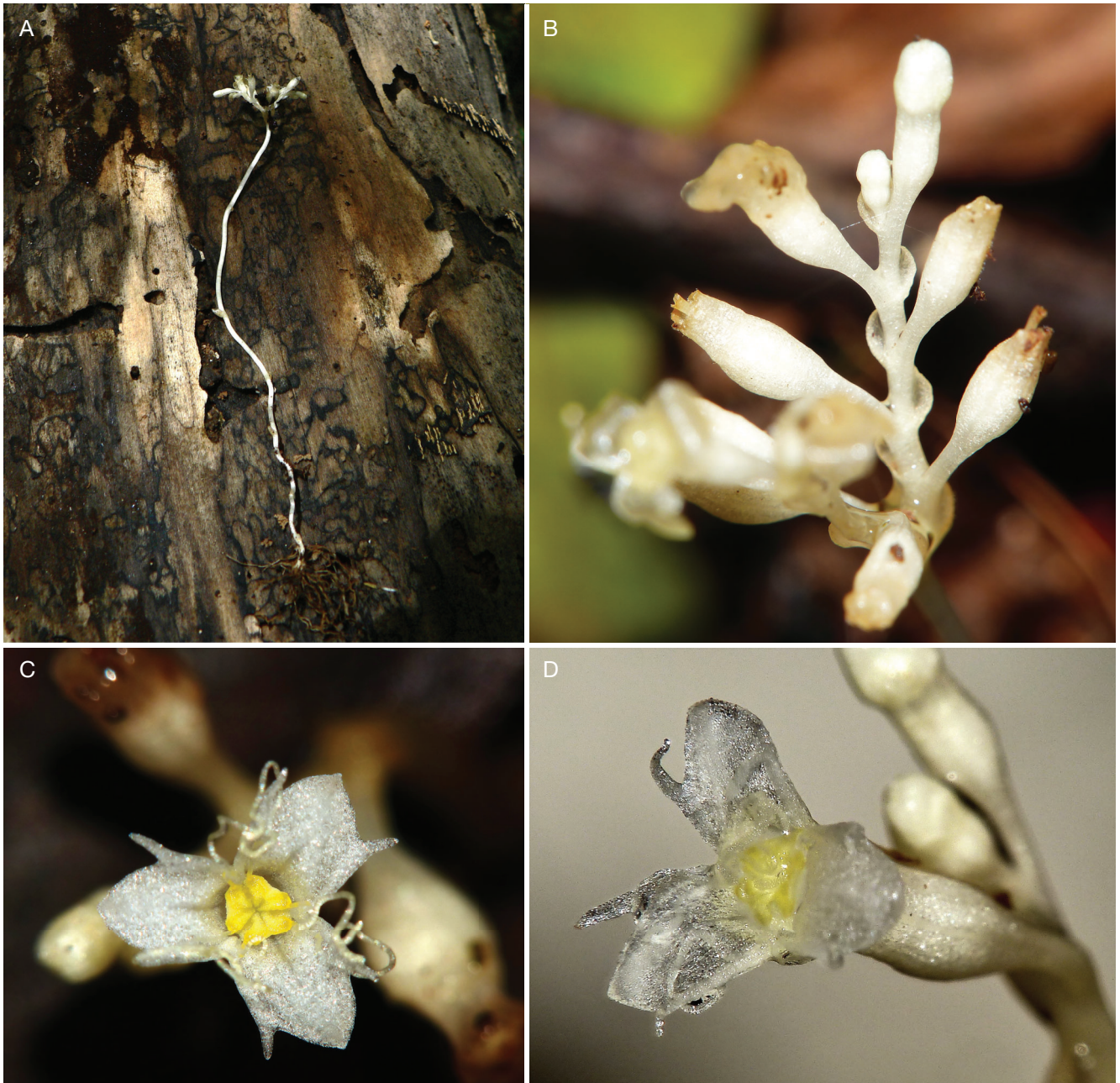
FIG. 2. — Gymnosiphon mayottensis Cheek, sp. nov.: A , habit, whole plant with underground parts exposed; B , inflorescence viewed from above, note navicular bracts; C , flower at anthesis viewed from above, note filamentous style arms; D , flower viewed from side, note the translucent tepals.

2012), using the IUCN-preferred grid cells of 4 km 2 , the area of occupancy is 8 km 2 , while the area of occurrence is difficult to calculate since only two points are known but is estimated as 9 km 2 , and the species is severely fragmented due to clearance of the forest habitat between the two sites. In addition, we estimate a decline in the area of occupancy, number of localities and habitat quality, and in the number of mature individuals. The number of mature individuals is less than 50. Therefore, we propose, using the IUCN (2012) standard, the assessment of this species as Critically Endangered (B1ab(i-iv), B2ab(i-iv), D) at the global and