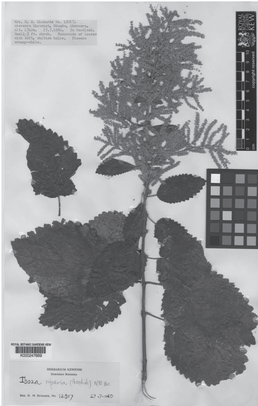
FIG. 3. — Tetradenia tanganyikae Phillipson, scanned image of holotype, Richards 12917 (K), from Ndundu in Mbala (Abercorn) district at 1740 m in Zambia.