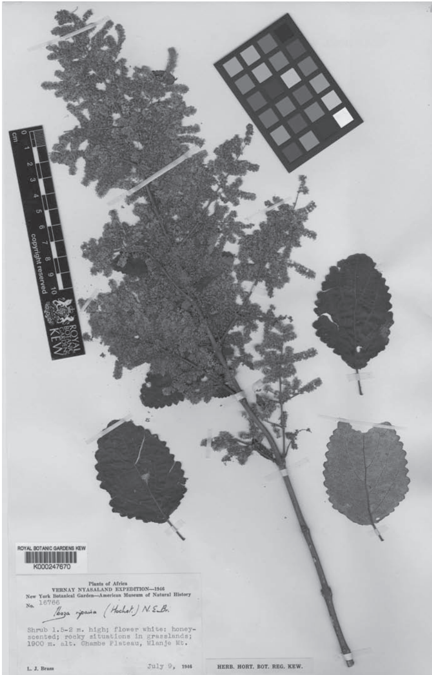
FIG. 1. — Tetradenia discolor Phillipson, scanned image of holotype, Brass, L.J. 16766 (K), from Chambe Plateau on Mlanje Mountain at 1900 m in Malawi.