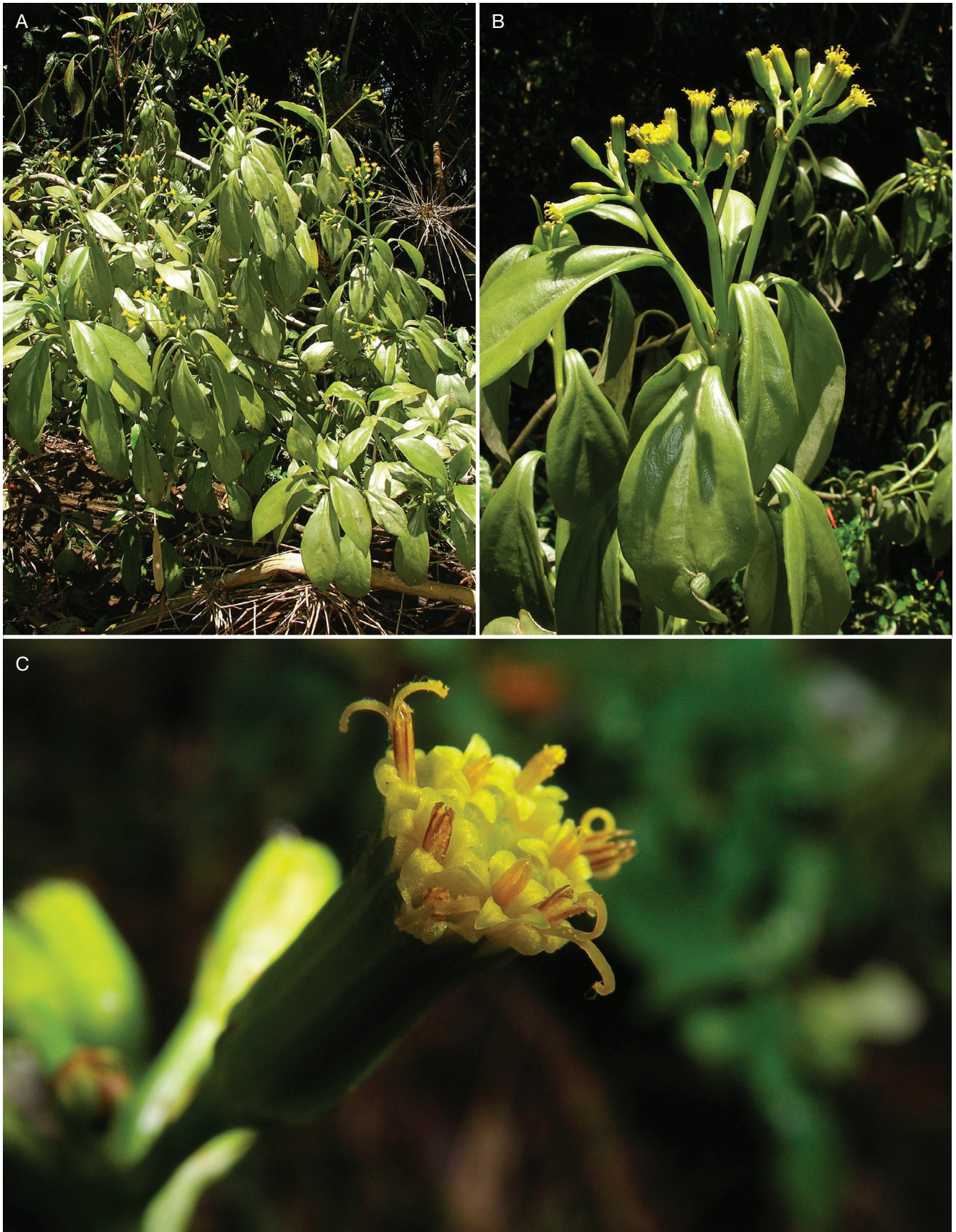
FIG. 2. — Field pictures of Senecio marinae J. Calvo & Callm., sp. nov.: A , habit; B , synflorescence; C , detail of the capitulum; A-C , Wohlhauser et al. 785.