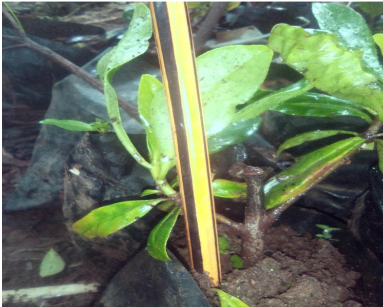
Figure 3: Transplant of weaned marcots of T. cameroonensis ; A: rooted marcotts transplanted into polythene bags; B and C: sprouted transplanted marcotts.