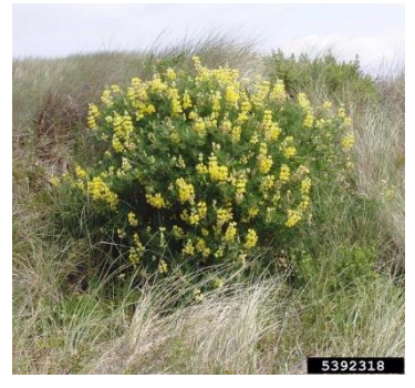
Mature 'Bush Lupine' L. arboreus