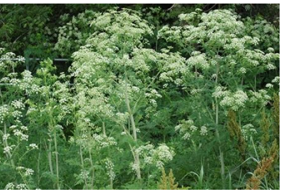
2.'Poison Hemlock' Conium maculata