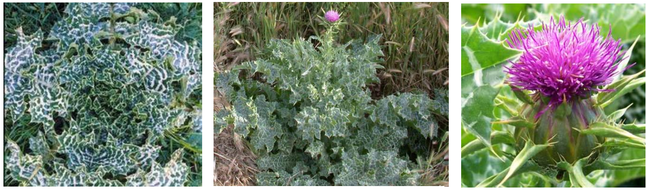
'Milk Thistle' Silybum marianum

Milkthistle ( Silybum marianum ): These may be the easist to identify of the invasive thistles from the white veins on the thick spined fleshy, ruffled leaves. The size of milkthistle plants can vary greatly depending on soil moisture. Milkthistle starts blooming in mid spring and produces large stalks and bright pink flowers with large spines.