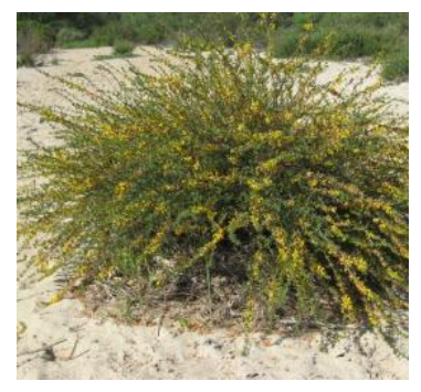
Mature 'Deerweed' A. glaber