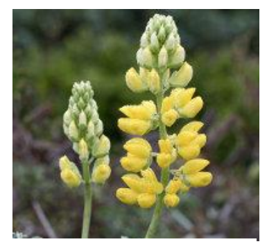
'Bush Lupine' L. arboreus flower