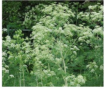
'Poison hemlock' Conium maculatum