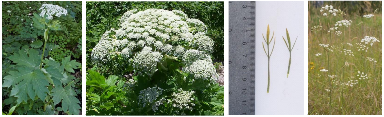
'Cow Parsnip' Heracleum maximum plant and flower