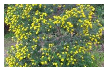
1.'French Broom' Genista monspessulana

The care shown by Preserve owners and landscaper contractors in implementing the Prohibited Plant List (attached) has been remarkably effective for avoiding impacts seen on neighboring properties. However, some of the most aggressive weeds are still finding their way into our Homelands, Openlands and Wildlands. This guide outlines how to identify our top weeds of concern, their threats to The Preserve, and Conservancy-approved invasive weed treatments for Homelands and Openlands. When working in the Openlands, following these guidelines is necessary to protect people, sensitive habitat and wildlife. Conservancy staff are always available to assist in assessing and addressing your weed challenges. These are the four 'weeds types' of particular concern on The Preserve at this time: