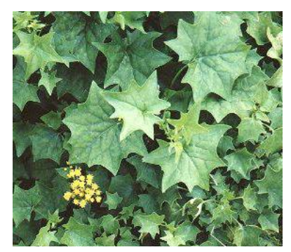
Cape Ivy Delairea odorata