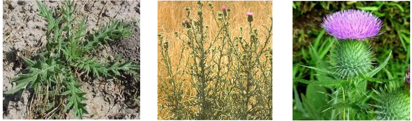
'Bull thistle' Cirsium vulgare

Bull Thistle ( Cirsium vulgare ): This is the largest of our invasive thistles growing up to 6 <sup>1</sup>/<sub>2</sub> feet tall. It has deep green foliage with large blossoms and spines. It is important to properly identify because it shares the most similar features to our native thistles. Distinguish bull thistle from natives by identifying the stiff, bristle like hairs on their foliage giving a sandpaper like feel. The shade of green is also a distinguishing feature compared to the more silver look of natives.