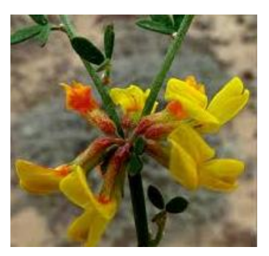
'Deerweed' A. glaber flower

<u>2. Poison Hemlock</u> ( Conium maculatum ) is an herbaceous biennial plant from Eurasia. It responds vigorously to disturbed earth, and tends to thrive in wet, open areas. The leaves have a lacey, fern-like appearance. Purple spots and streaks occur along the hollow stalk, which ranges in height from 2 to 10 feet tall. In the winter, early growth of hemlock is easily noticeable from the bright green color of early growth. In the spring, the feathery foliage begins to bolt, producing white compound flowers which form seeds in early to mid-summer. Plants dry into tall stiff dead stalks in late summer and fall, increasing fire risk. The vegetation is toxic to people and animals if consumed.