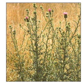
3. 'Invasive Thistles' Carduus spp., Silybum sp., Circium spp.