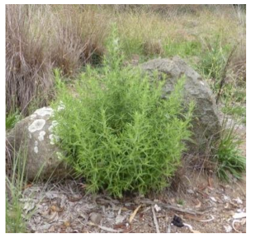
4.'Stinkwort' Dittrichia graveolens