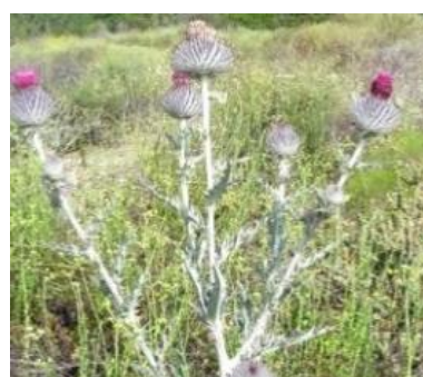
'Cobweb thistle' Cirsium occidentale spp.