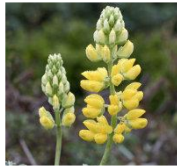
'Bush Lupine' L. arboreus flower