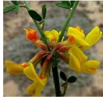
'Deerweed' A. glaber flower

2. Poison Hemlock ( Conium maculatum ) is an herbaceous biennial plant from Eurasia. It responds vigorously to disturbed earth, and tends to thrive in wet, open areas. The leaves have a lacey, fern-like appearance. Purple spots and streaks occur along the hollow stalk, which ranges in height from 2 to 10 feet tall. In the winter, early growth of hemlock is easily noticeable from the bright green color of early growth. In the spring, the feathery foliage begins to bolt, producing white compound flowers which form seeds in early to mid-summer. Plants dry into tall stiff dead stalks in late summer and fall, increasing fire risk. The vegetation is toxic to people and animals if consumed.