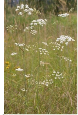
'Cow Parsnip' Heracleum maximum plant and flower