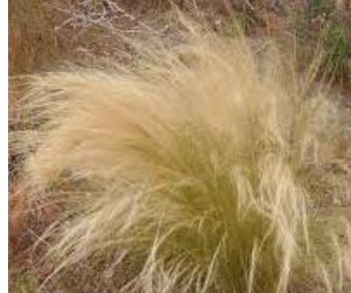
Mexican Feather Grass Nassella tenuissima