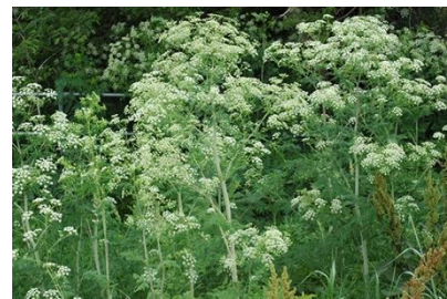
2. 'Poison Hemlock' Conium maculata