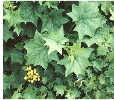
Cape Ivy Delairea odorata