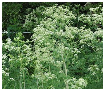
'Poison hemlock' Conium maculatum