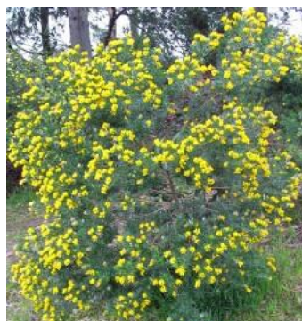
'French Broom' Genista monspessulana