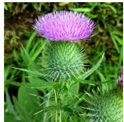
'Bull thistle' Cirsium vulgare

Yellow Starthistle ( Centaurea solstitialis ): Through vigorous monitoring and rapid response, yellow star thistle is largely controlled on The Preserve. However, new seeds can come in on construction equipment and other sources, so vigilance is required. This thistle is considered a 'zero tolerance' weed by the Conservancy; if you detect yellow starthistle anywhere on The Preserve, contact us immediately with specific information on its location. Yellow starthistle is poisonous for horses and can be fatal. Yellow starthistle has grey-green to blue-green foliage covered in fine cottony hairs, forms dense patches, and has a deep taproot. The flower is bright yellow with sharp spines around the base.