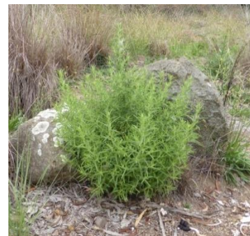
4. 'Stinkwort' Dittrichia graveolens