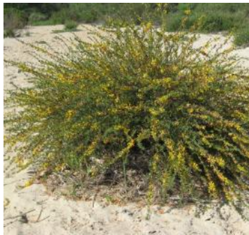
Mature 'Deerweed' A. glaber