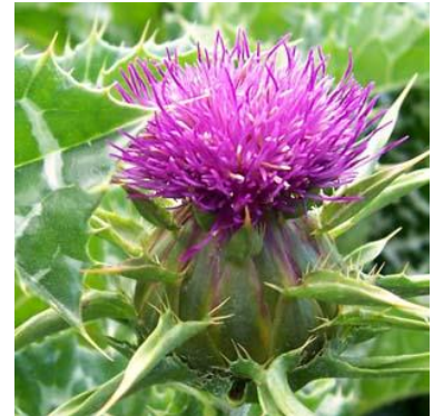
'Milk Thistle' Silybum marianum

Bull Thistle ( Cirsium vulgare ): This is the largest of our invasive thistles growing up to 6 ½ feet tall. It has deep green foliage with large blossoms and spines. It is important to properly identify because it shares the most similar features to our native thistles. Distinguish bull thistle from natives by identifying the stiff, bristle like hairs on their foliage giving a sandpaper like feel. The shade of green is also a distinguishing feature compared to the more silver look of natives.