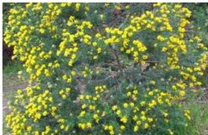
1. 'French Broom' Genista monspessulana