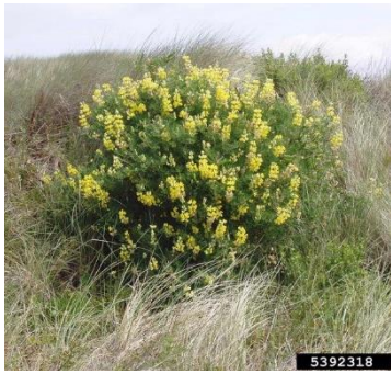
Mature 'Bush Lupine' L. arboreus