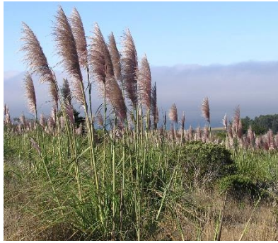
Pampas and Jubata Grass Cortaderia spp.