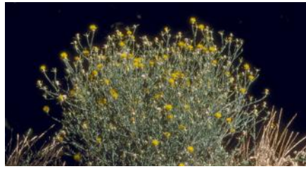
'Star thistle' Centaurea solstitialis