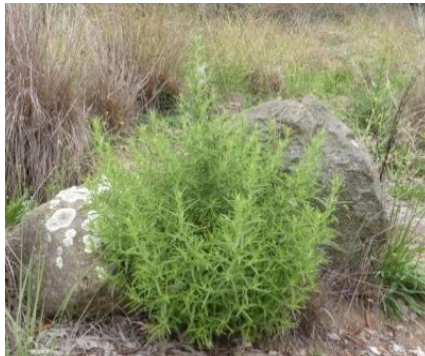
'Stinkwort' Dittrichia graveolens