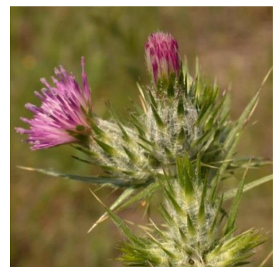
'Italian Thistle' Carduus spp.