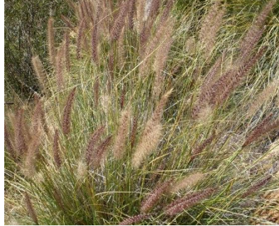
Fountain Grass Pennisetum setaceum