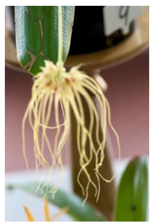
Bulb. medusae x pereus. Duncan