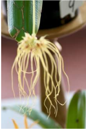
Bulb. medusae x pereus. Duncan