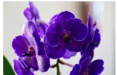
V. Pure Wax - Gabrielle