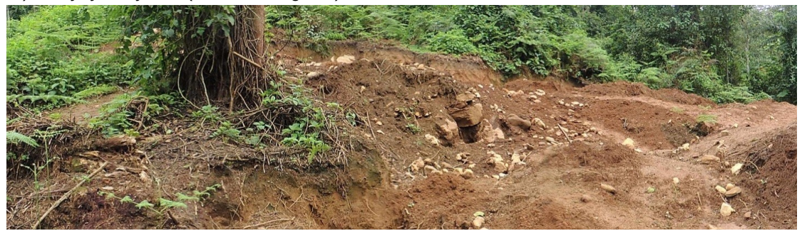
Fig. 3. Photos showing typical forest from each inventory site.