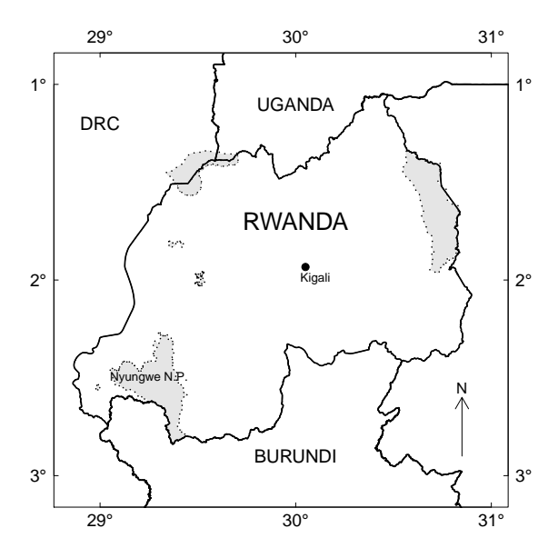
Fig. 1. Map of Rwanda, showing Nyungwe National Park.

projects bordering the parks. These revenues are apportioned 40% to communities located near Volcanoes National Park and 30% each to Akagera and Nyungwe National Parks. Despite this effort, illegal activities still occur within Nyungwe National Park and nearby communities still rely on forest resources or extractive mining to sustain their livelihoods.