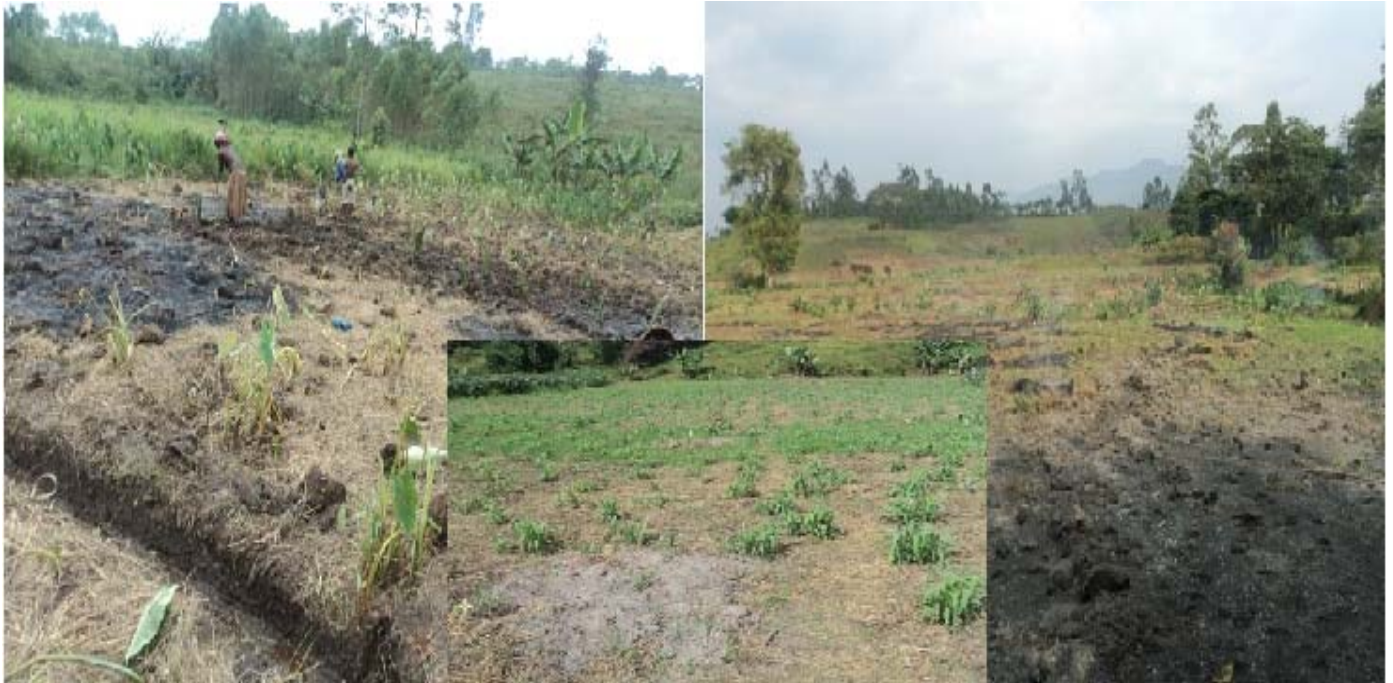
Figure 1. Ash added by burning of plants and crop residues during cultivation in cultivated wetland site.

(3.62) sites. It was relatively decreased about 16% due to cultivation. The lower concentration of available phosphorus in cultivated site could be the result of continuous loss of phosphorous through crop harvesting, plant and crop residues removal. On other hand, continuous application OM through litter fall and dying of plant in uncultivated site could increase soil phosphorus availability by decomposition and mineralization of organic phosphorous (OP) and reduce phosphate adsorption in the soil colloids (Yusran, 2010).