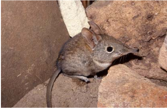
Cape Sengi, Elephantulus edwardii

principally wait-dash-snatch hunters, operating from the edge of shaded crevices. The one exception observed was of sengis foraging on the communal dung middens of Rock hyraxes, where they flicked over dung pellets with their front feet, and to a lesser extent their snout, to expose ants, termites, flies, and beetles. Only three ectoparasites were identified from Cape Sengis, namely the louse Polyplax biseriata , and two ticks, Ixodes sp. and Rhipicephalus cf. simus .