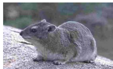
A Yellow-spotted (or Bush) Hyrax, Heterohyrax brucei

Abundance, species ratios, and age distributions of the syntopic Rock Hyrax ( Procavia capensis ) and Yellow-spotted Hyrax ( Heterohyrax brucei ) were monitored from 1992-2001 in the 424 km 2 Matobo National Park (MNP), Zimbabwe, following suspected decreases in numbers through the 1980s. Hyraxes were identified to species and age class (adult, subadult and juvenile) and counted at 20 permanent observation posts in April-May each year following the birth event in March. We used the ratio method for aerial surveys to estimate hyrax abundance. The estimate of total abundance of hyraxes was lowest in 1995 at 52,900 (95% confidence interval of 36,600 to 69,300). Populations recovered to 140,600 by 1998 (110,800 to 170,400). P. capensis ranged from a low of 31,100 (22,600 to 39,600) in 1995 to a high of 59,200 (44,300 to 74,100) in 1998 before a 3-year decline. H. brucei ranged from 21,800 (11,900 to 31,700) in 1995 to 81,400 (65,000 to 97,900) in 1998, followed by a 2-year decline. The species ratio varied significantly ( P < 0.001 ) across years, H. brucei increasing disproportionately through the study period. Juveniles and subadults comprised 26% (1994) to 39% (2001) for P. capensis and 26% (1994) to 46% (1998) of H. brucei populations. Fluctuations of hyrax populations and temporal variation in the species ratio appear to be responses to annual rainfall, population dynamics of the black eagle, Aquila verreauxii (the principal predator), and an outbreak of mange in 1998.