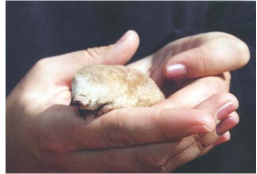
A Juliana Golden Mole, Neamblysomus julianae, in hand

on the north-facing slope are critical corridors for the movement of the golden moles. Our specialist group believes that if these corridors are transgressed, further fragmentation of this "eastern population" will result, thereby potentially further threatening the viability of the population. This degradation and a general decline in the population are ongoing despite the massive dearth in knowledge regarding the intraspecific phylogeny, population genetics, phylogeography and breeding strategies of the species, knowledge that is crucial for making informed management decisions relevant to their conservation.