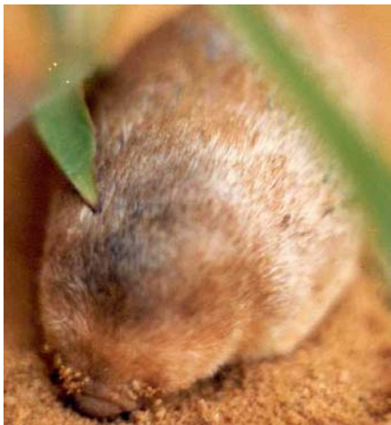
Juliana Golden Mole, Neamblysomus julianae