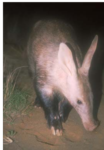
Aardvark, Orycteropus afer