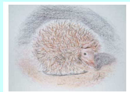
Lesser hedgehog tenrec, Echinops telfairi

Communications Officer, IUCN - Species Programme, rue Mauverney 28, CH-1196 Gland, Switzerland Email: ALK@hq.iucn.org