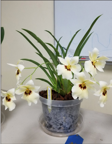
Miltoniopsis Quintals La