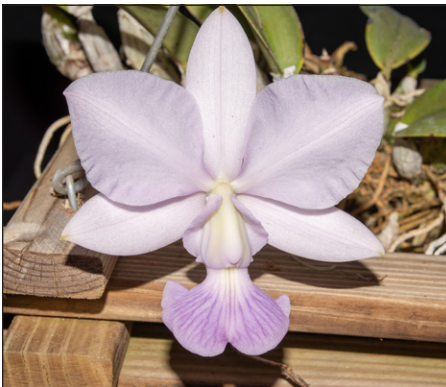
C. walkeriana f. coerulea 'Missy's Blue Poodle' AM/AOS