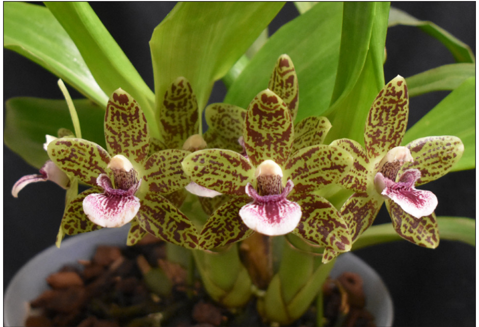
Nottara Lucy's Sassafras 'Marian Jane' FCC/AOS