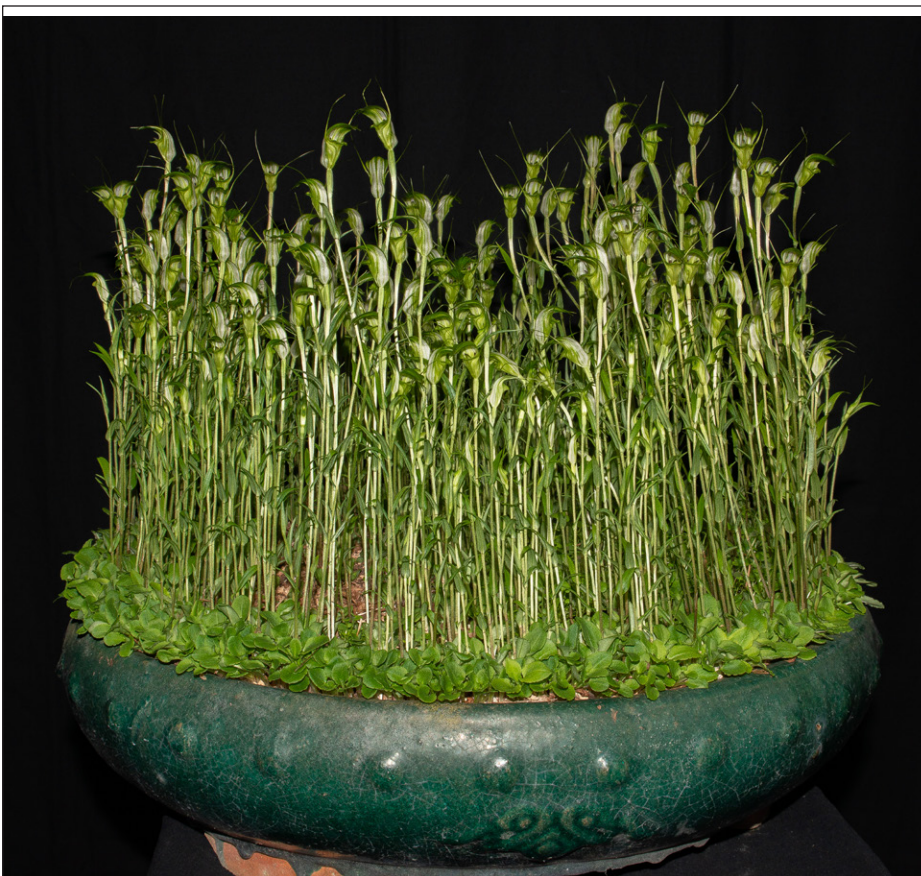
Pterostylis obtusa 'Tuscarosa Spirit' CCE/AOS