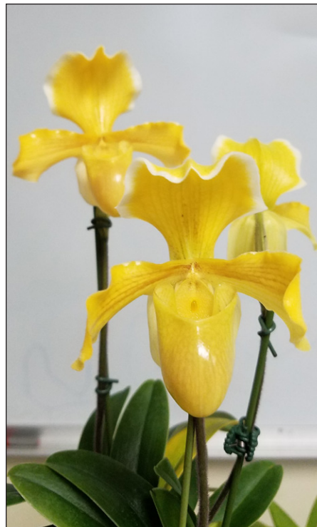
Paph. In-Charm Topaz