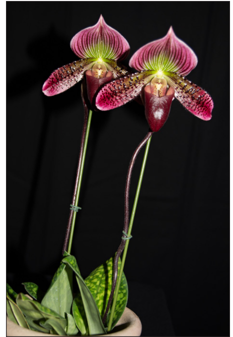
Paph. Fred's Triumph 'MBF' AM/AOS