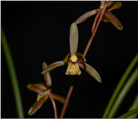
Cym. cyperifolium ssp. Indochinense 'Mello Spirit' CHM/AOS