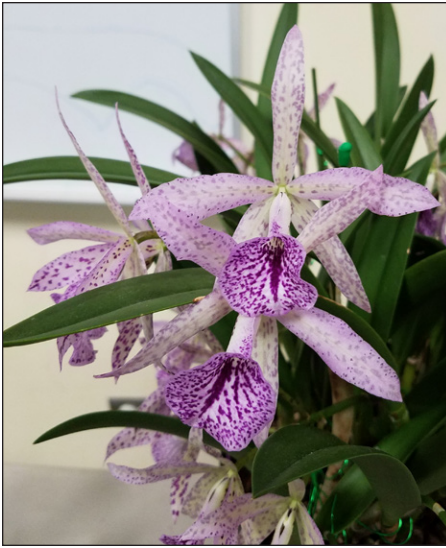
Brassanthe Maikai 'Spotted Star'