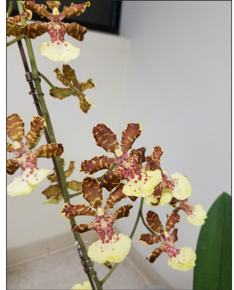
Trichocentrum Kuquat 'Horent'