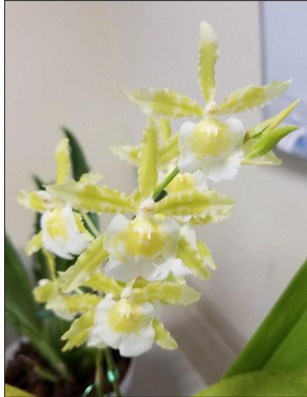
Oncidium Irish Mist 'Wintergreen'