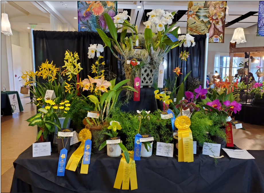
AOS Show Trophy: Marble Branch Farms