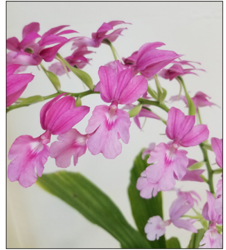
Calanthe Rose Georgene 'Electric Pink' HCC/AOS