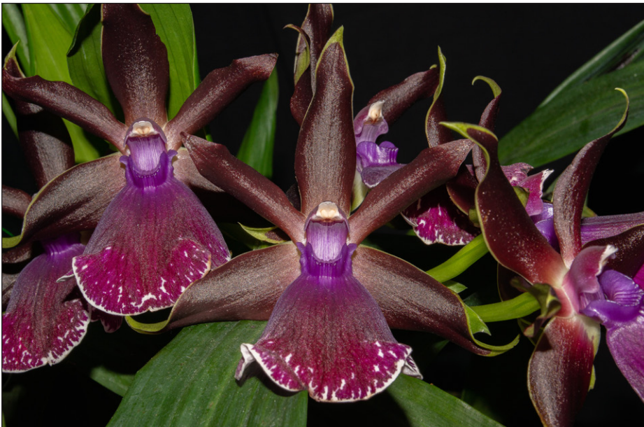
Zygolum Louisendorf grex 'Isabel' AM/AOS

Paphiopedilum Presidential Double 'Pisgah Spirit' ( Paph. Presidential Pops x Paph. Presidential Moon ), HCC 77 points. Exhibitor: Owens Orchids