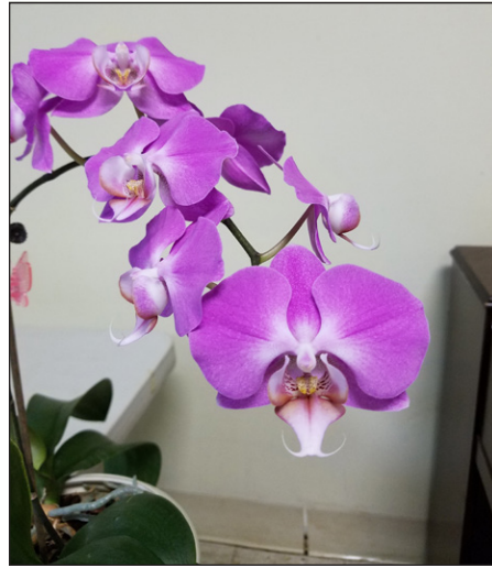
Phal. No ID