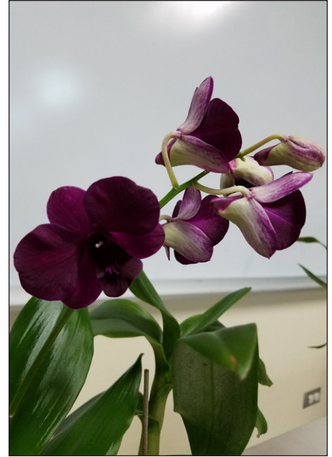
Dendrobium Blue Violette x Red Maroon

This beautiful species comes from low elevations in western New Guinea and the Molucca Islands to the west of there. This region is close to the equator, clothed in lush tropical forest and receives 80 to 150 inches of annual rainfall. Rainfall is lower in the winter months, but there is no actual dry season, and the humidity remains high throughout the year. It is sometimes sold as Den. sulawesienne . Young plants will produce leafy canes that are upright, but as the plants mature, the weight of the longer canes pulls them down in all directions. If you have limited space, you can stake the stems and they will still flower normally, but some plants will produce stems that exceed three feet in length so headroom will be needed. Den. glomeratum is gradually deciduous and only flowers on mature canes that are completely bare. These stems can flower several times a year at random nodes almost anywhere along their length with tight clusters of long-lasting flowers in shades of rose-pink offset by a small orange lip. A good plant such as this one can have color that is truly intense and flowers up to 2 inches across. A well grown older plant can be a truly spectacular sight in flower, but patience will be required as it will take several years of good care to bring a plant