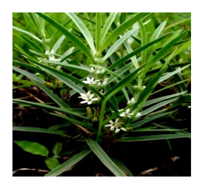
Fig. 2 Mamajjaka (Enicostemma littorale Blume.)<sup>[15]</sup>