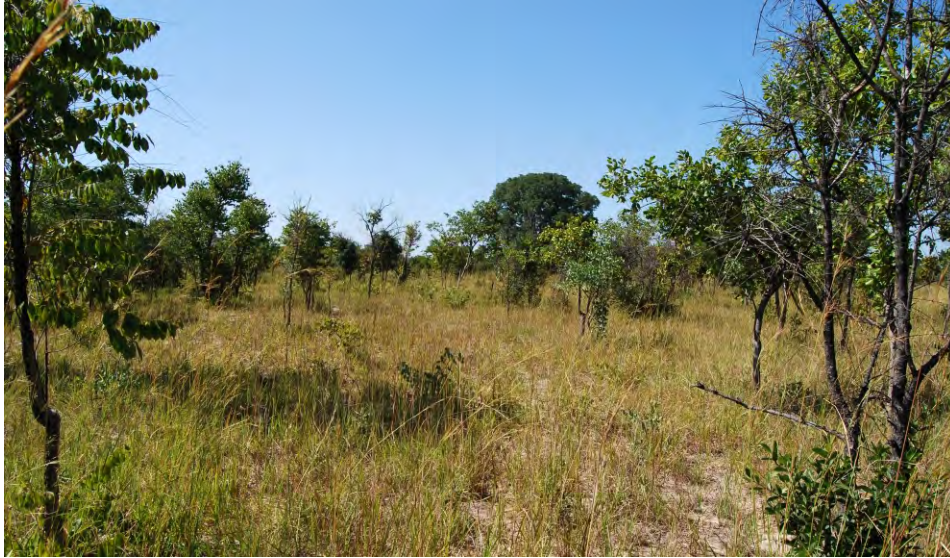
Fig. 3: Diplorhynchus condylocarpon - Gymnosporia senegalensis unit [ Baikiaea - Burkea woodlands (open)].