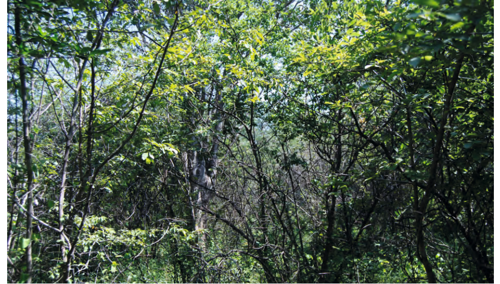
Fig. 4: Combretum celastroides - Baikiaea plurijuga unit [ Baikiaea - Burkea woodlands with thicket like understorey] on the eastern hills of the Caiundo core site.