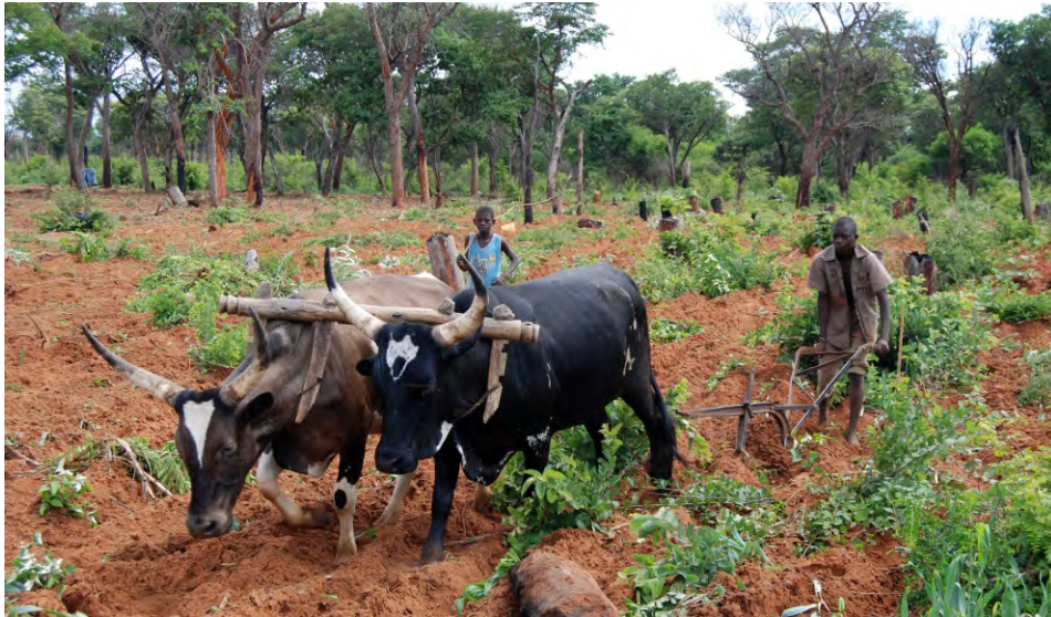
Fig. 5: Combretum celastroides - Baikiaea plurijuga woodland has been cleared for agriculture.