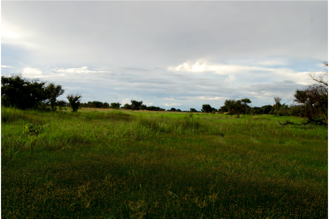
Fig. 7: Recent floodplain at the start of the rainy season [seasonally flooded grasslands].