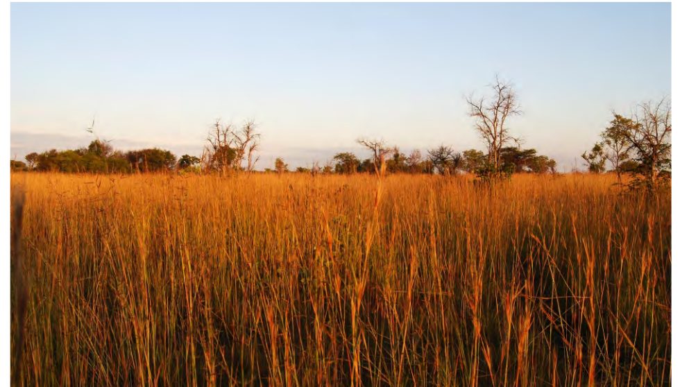
Fig. 6: Piliostigma thonningii - Acacia sieberiana unit [grasslands] of the old floodplain with wooded islands on and around giant termite mounds.