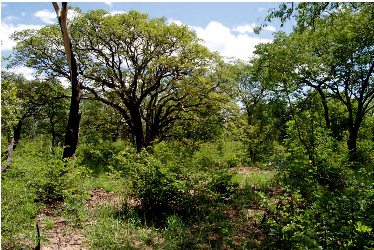
Fig. 2: Erythrophleum africanum - Bauhinia urbaniana vegetation unit [ Baikiaea - Burkea woodlands (dense)].

recent floodplain is dotted with giant termite mounds created by species of the genus Macrotermes . These mounds reach heights of up to 4 m and their diameter exceeds 10 m. Due to the accumulation of clay and silt the mounds represent a special habitat in an otherwise sandy and nutrient-poor environment. Hence, a distinct vegetation in terms of species composition and structure has evolved around the termite mounds creating a local hotspot of biodiversity (Fig. 9). Succulent species such as Sansevieria sp. and spiny shrubs and trees dominate the vegetation.