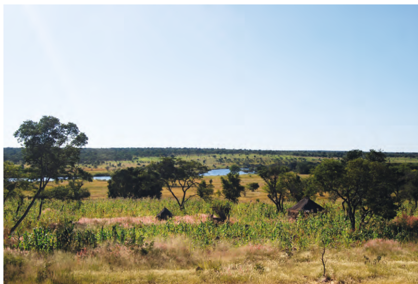
Fig. 1: Maize field on the old floodplain, solitary Acacia sieberiana tree.

The species composition is very distinct and character species reach very high phi -values. There is just one tree species forming the upper canopy, Baikiaea plurijuga , whereas several shrub species