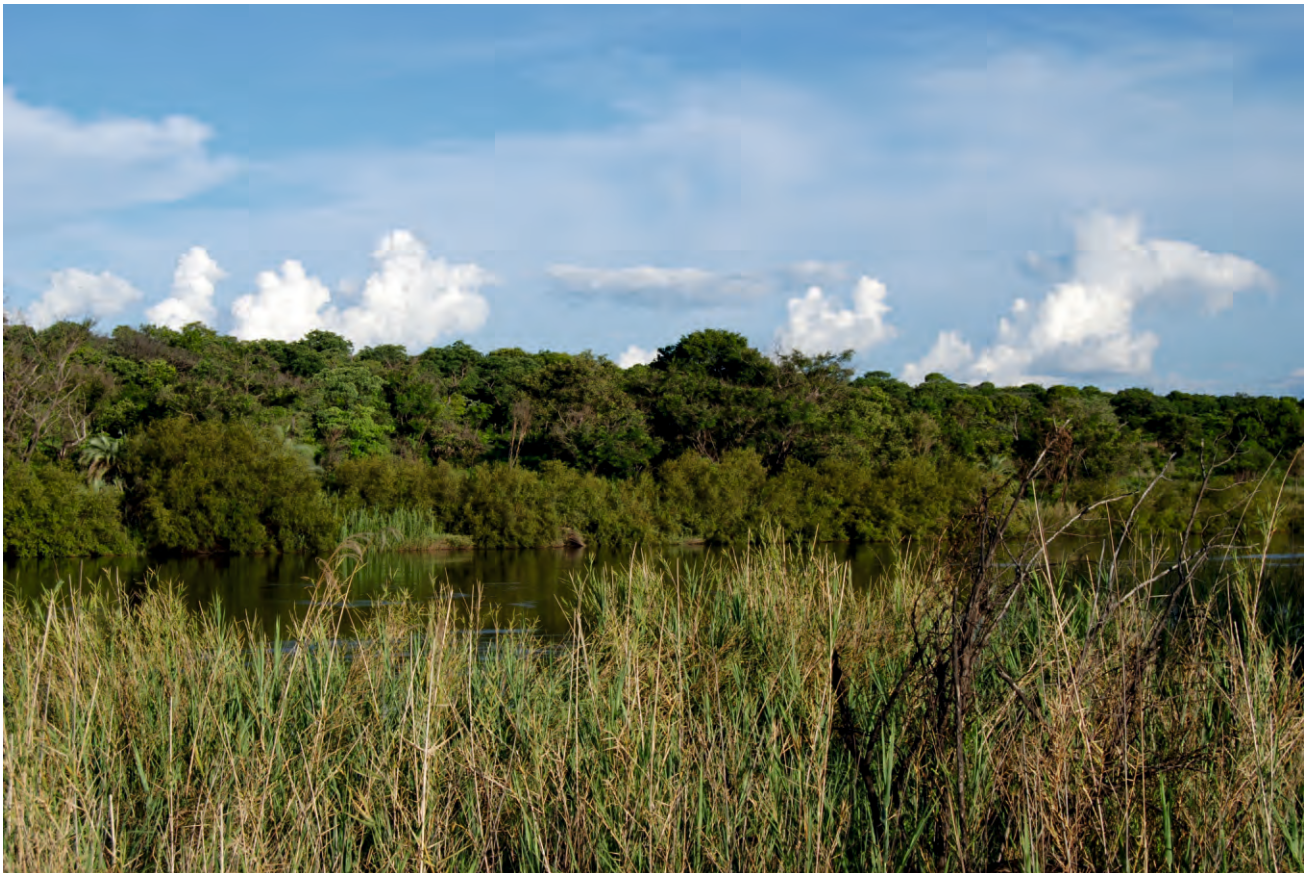
Fig. 8: Phragmites reeds along the river and dense gallery forest on the opposite bank of the river [riparian vegetation].