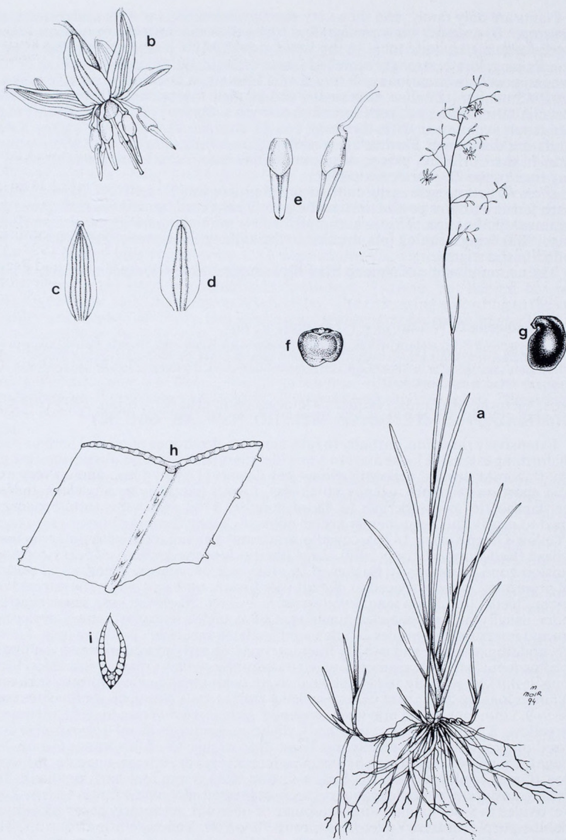
Fig. 2. Dianella amoena . a — habit \times 0.2 . b — flower \times 2 . c — outer tepal \times 2 . d — inner tepal \times 2 . e — anther adaxial — abaxial \times 4 . f — fruit \times 1 . g — seed \times 4 . h — section through mid leaf lamina \times 4 . i — cross section mid leaf sheath \times 4 .