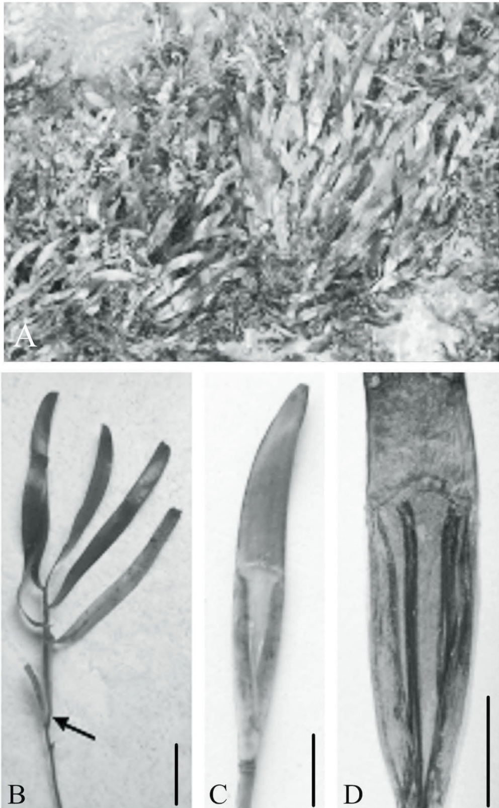
Figure 1. Thalassodendron leptocaule Maria C. Duarte, Bandeira & Romeiras. —A. Community of T. leptocaule and seaweeds in rocky pools, Inhaca Island, Ponta Mazónduè, Mozambique. —B. Flowering shoot with viviparous seedling (arrow). —C. Inner bract enclosing the female flower in fresh specimen. —D. Inner bract enclosing the female flower (M. C. Duarte & A. M. Manjate 3801, LIISC). Scale bars: B = 15 mm; C, D = 5 mm.