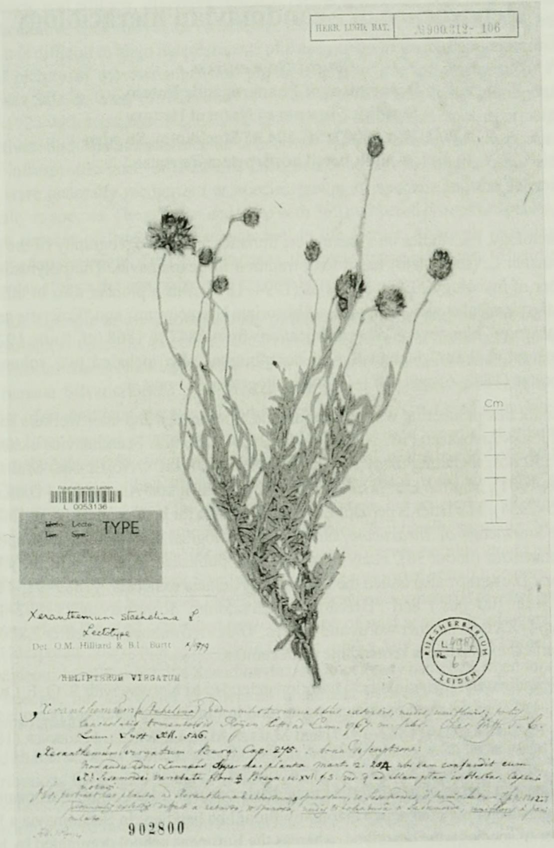
Fig. 2. Type of Xeranthemum staehelina L., Herb. van Royen, L, sheet 900, 312-106 = Syncarpha staehelina (L.) B. Nord.