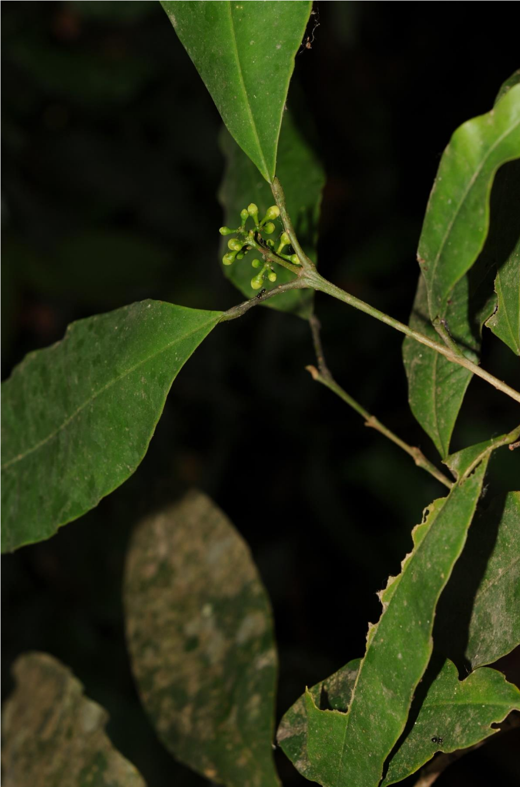
Fig. 1. Vepris laurifolia . Photo showing habit of flowering plant (Cheek 16600, HNG, K) in habitat near Madina Oula, Republic of Guinea near the border with Sierra Leone, in 2012.

large national parks (e.g. Tai National Park, Gola Rainforest National Park) are known to support it, despite botanical inventory effort. The species was assessed as Critically Endangered (CR) under criterion C2a(i) since less than 250 mature individuals are thought to exist and there is a continuing decline in the number of mature individuals, with less than 50 individuals in each subpopulation (Cheek 2017). In Guinea the species is included in two Tropical Important Plant Areas, Kounounkan and Ziama (Couch et al. 2019).