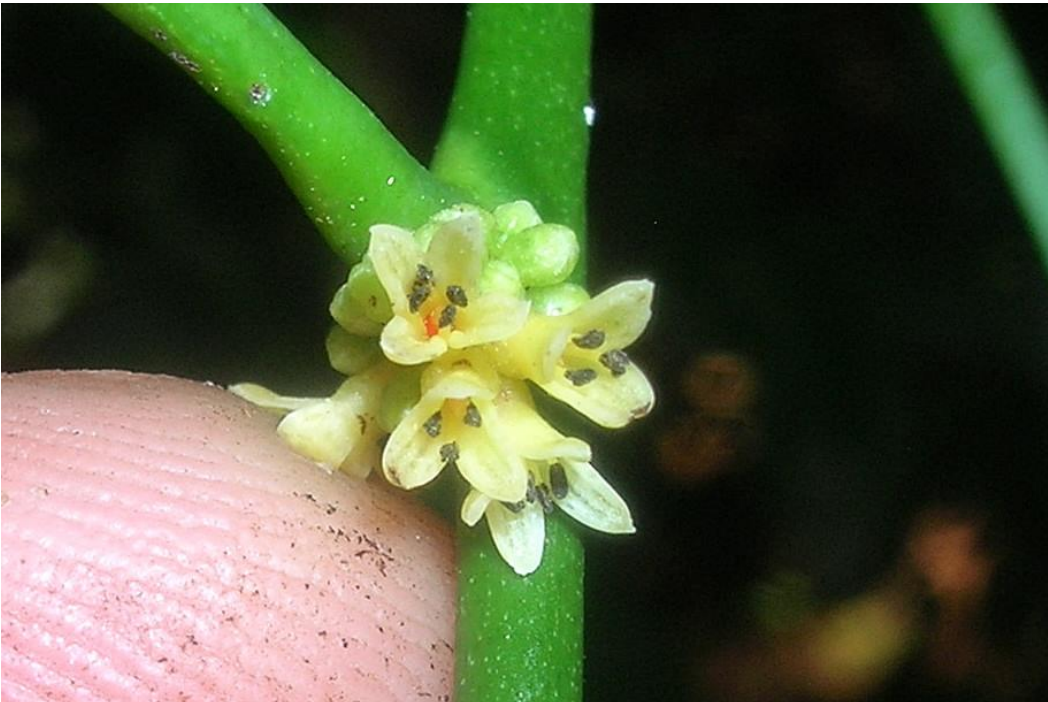
Fig. 5. Vepris robertsoniae Close up of male flowers, note the four stamens, cultivated plant in Base Titanium nursery 28 May 2021.