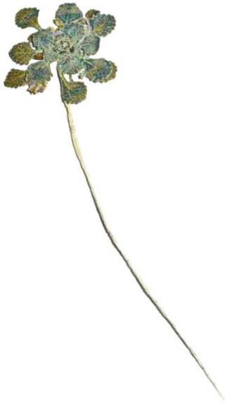
Fig. 1) The pressed herbarium type specimen of Viola unica . (Photo - A.R. Flores, 25 Aug 2008)