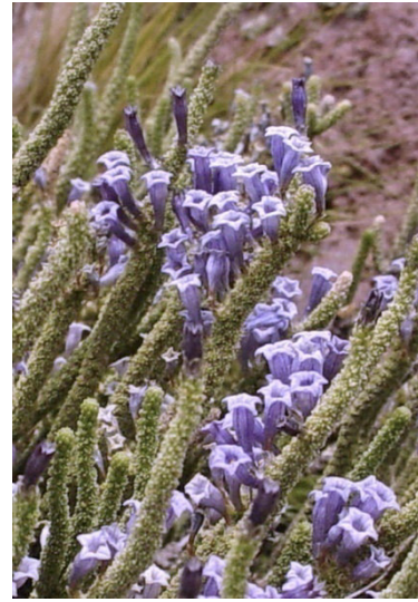
Fig. 9) Fabiana bryoides . (Photo - A.R. Flores, 6 Jan 2006)