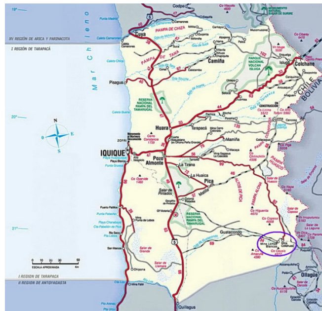
Fig. 6) Tarapacá Region, northern Chile, with violet-ringed area within which Viola unica occurs.