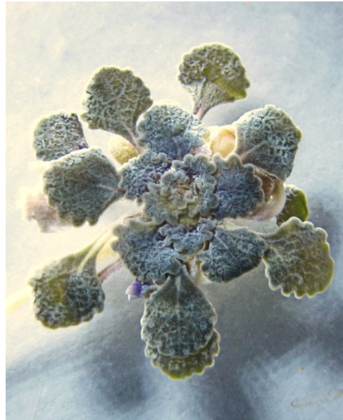
Fig. 2) Plan view of rosette of soaked type specimen of Viola unica . (Photo - A.R. Flores, 7 Jun 2019)