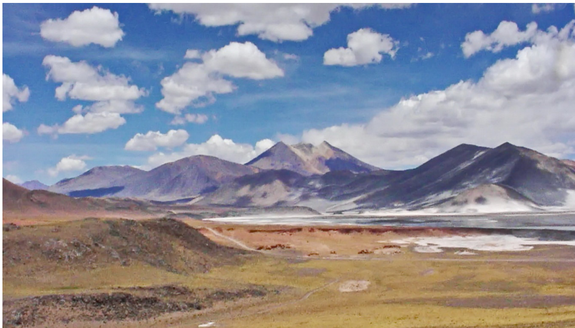
Fig. 7) Typical Chilean high Altiplano landscape and vegetation, shortly to the south of Collahuasi, type area of Viola unica . (Photo - A.R. Flores, 6 Jan 2006)