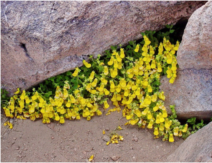
Fig. 8) Calceolaria stellariifolia .