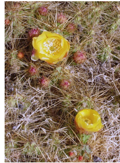
Fig. 11) Maihueniopsis boliviana . (Photo - A.R. Flores, 6 Jan 2006)