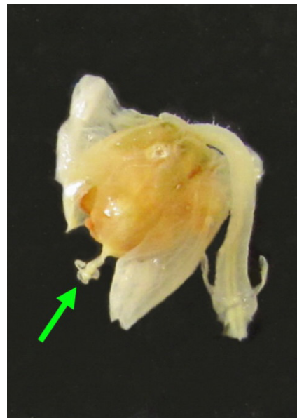
Fig. 4) Preserved Viola unica flower showing peduncle with basal bracteoles, ripe capsule, and attached trilobed style crest arrowed green.