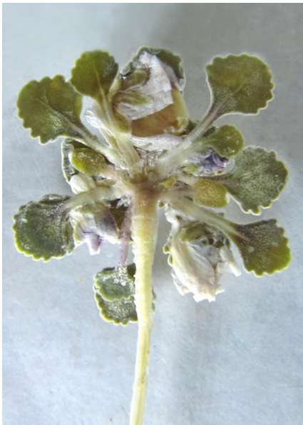
Fig. 3) Underside of rosette of soaked type specimen of Viola unica . (Photo - A.R. Flores, 7 June 2019)