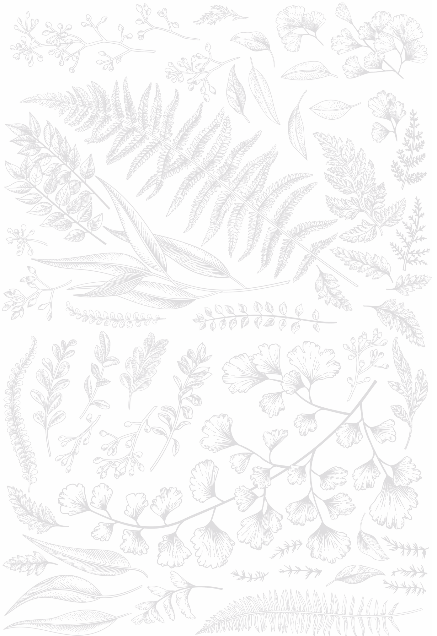
Cover photo: xRhynchomesidium [ Rhynchostele uroskinneri x Gomesa praetexta x Oncidium crispum , hybridization by J. R. Haager]