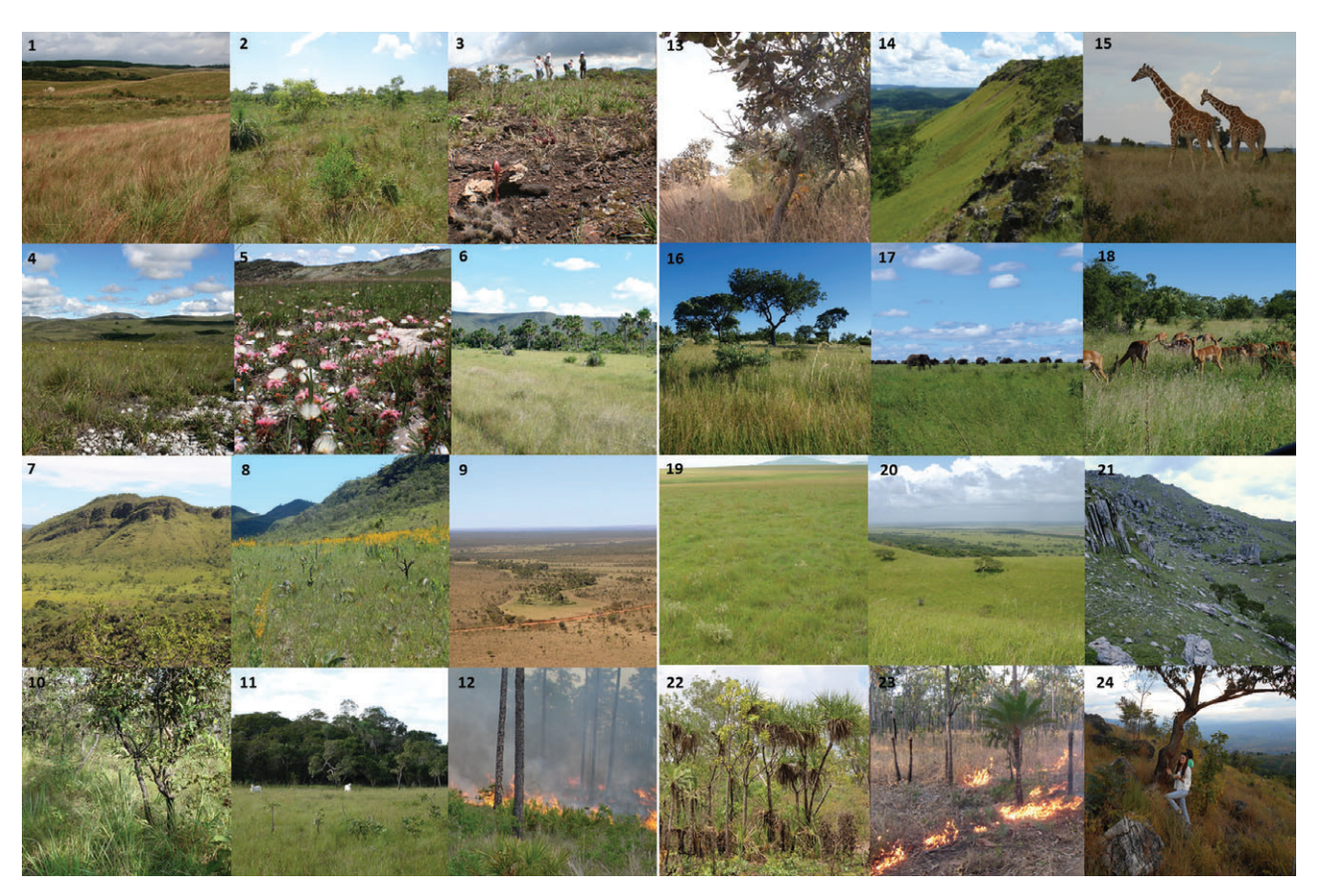
Fig. 1. Images of tropical and subtropical old-growth grasslands, savannas, and grassy woodlands with numbers on the images corresponding to the numbered geographical locations shown in online Appendix S2 in File S1, Fig. S1). (1) Subtropical grasslands (campos sulinos) in Rio Grande do Sul, Brazil. (2) Cerrado moist grasslands in São Paulo, Brazil. (3) Cangas grasslands, on ironstone outcrops in the Iron Quadrangle, Brazil. (4) Campo rupestre grasslands, southeastern Brazil. (5) Campo rupestre grasslands a few months after fire, southeastern Brazil. (6) Cerrado grasslands in Tocantins (vereda), Brazil. (7, 8) Cerrado in Goiás (campo sujo), Brazil. (9) Cerrado grasslands in Tocantins (campo sujo and vereda), Brazil. (10) Cerrado in eastern lowland Bolivia. (11) Cattle in grassland-forest mosaic Bolivia. (12) Prescribed fire in a subtropical pine savanna, southern USA. (13) Miombo, Uapaca kirkina savanna, Congo. (14) Katanga copper outcrops, Congo. (15) Savanna in Kenya. (16–18) Savanna in Kruger National Park, South Africa. (19) Montane grasslands, South Africa. (20) Coastal grasslands South Africa. (21) Tapia (Uapaca bojeri) savanna and quartzic grasslands on Ibity mountain, Madagascar. (22, 23) Pandanus, cycads and Eucalyptus savanna, Northern Territory, Australia. (24) High-elevation savanna, southwest China; also see Ratnam et al. (2016) for Asia.

short-lived perennial species, old-growth grasslands of the humid tropics are typically composed of long-lived perennial grasses and forbs (Bond & Zaloumis, 2016); for this reason, our review focuses primarily on the ecology of perennial grassland plants.