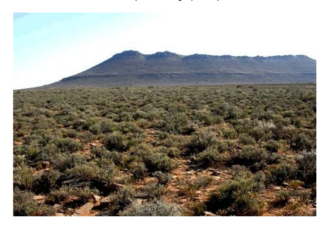
Photograph 6.1: Upper Nama Karoo vegetation occurring within the study area (Veld type 50)

Vegetation of the hills and mountains is fairly grassy with grass species such as Eragrostis lehmanniana , E. bergiana and Aristida congesta subsp congesta the most common. Typical shrubs and shrublets (karroo bushes) of these areas include Rhus undulata , R. burchellii , Rhigozum trichotomum , Lycium spp. and in some areas even Aloe broomii (See Photograph 6.1)