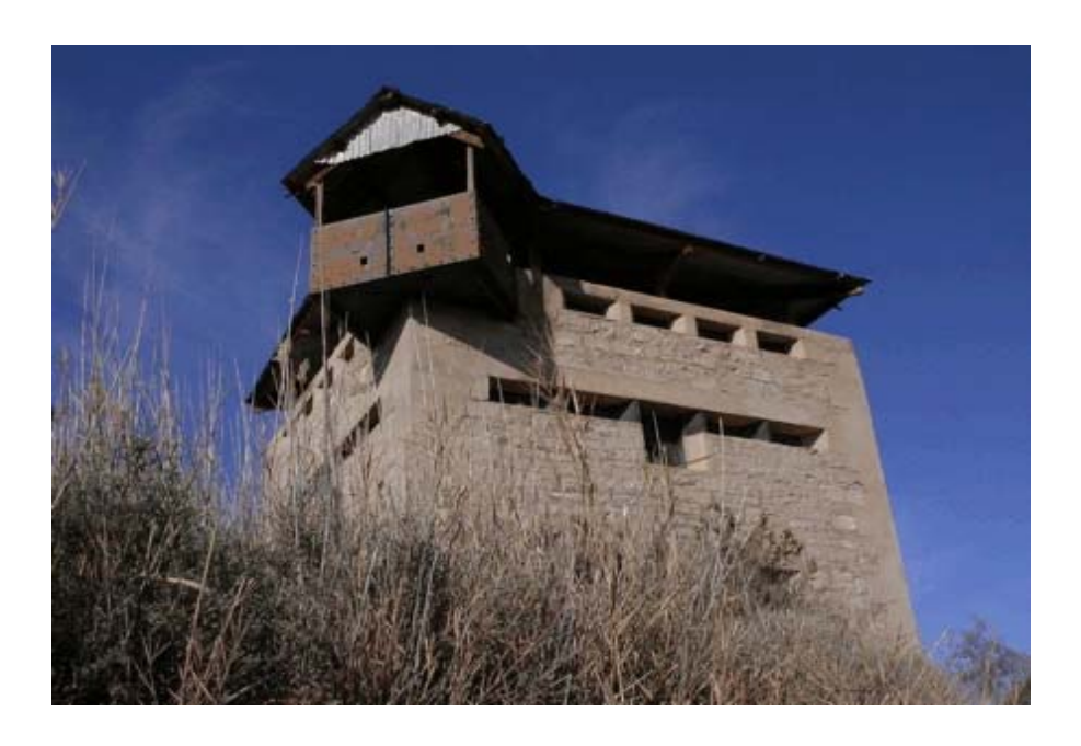
Photograph 6.5: Masonry blockhouse at Merriman close to Deelfontein

Known archaeological and rock art sites exist on the farms Nieuwejaars Fountain, Minfontein and Deelfontein (Morris 1991; 2000b) (see Photograph 6.6.).