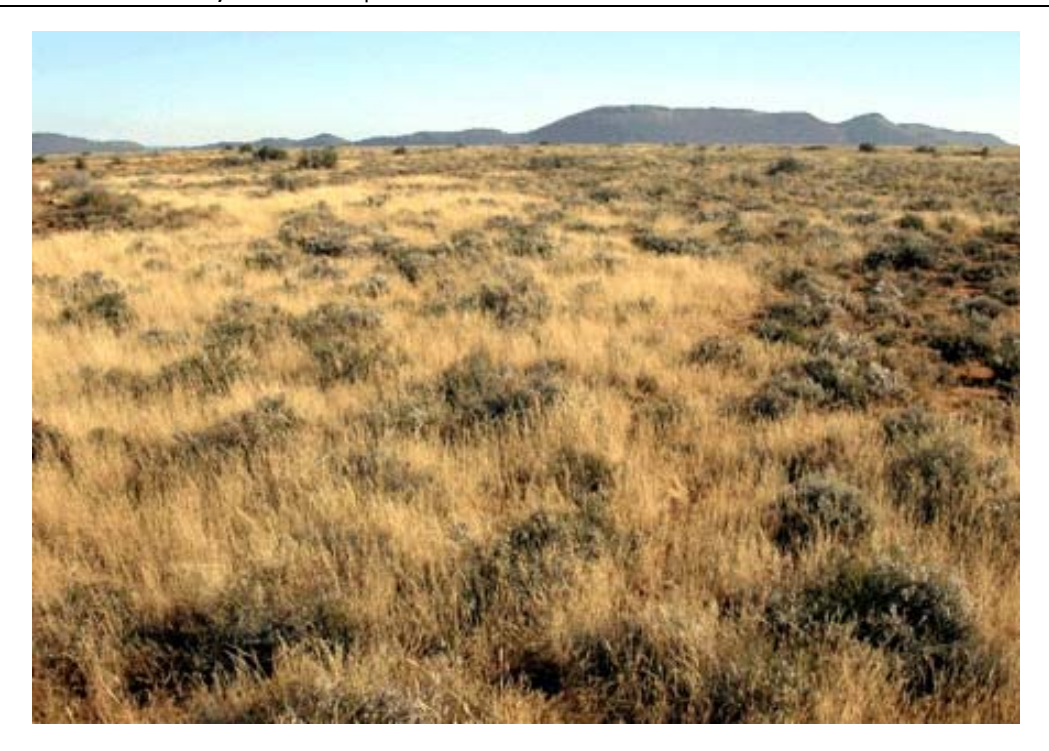
Photograph 6.2 : Eastern mixed Nama Karoo vegetation occurring in the study area