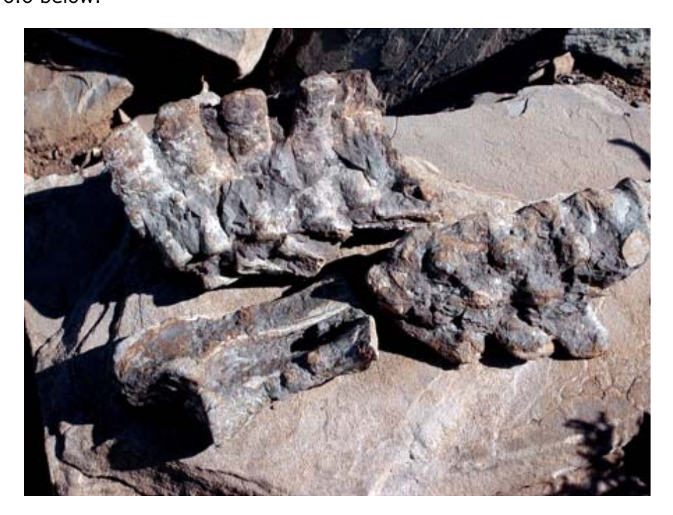
Photograph 6.4: Fossil remains found in the study area

Photographs of the various sites identified above are represented in Figures 6.4 6.6 below.