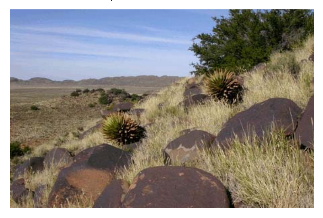
Photograph 6.3: Vegetation of the hills showing Aloe broomi and Cenchrus cilaris