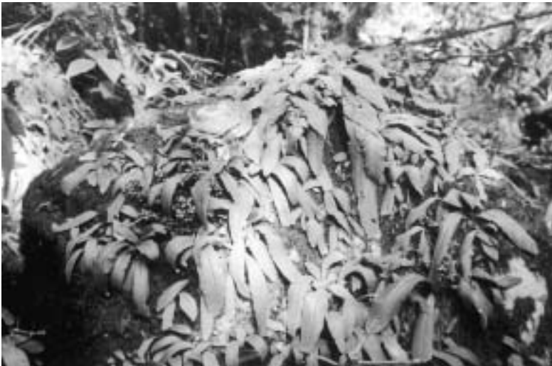
Streptocarpus primulifolius enjoying its rock habitat

Weathered rock surfaces often provide habitats where certain streptocarpus find suitable areas to colonise. Shale and slate-type rock are inhospitable for streptocarpus, and where there are different geological formations in an area, the rock should be the "right type", such as sandstone or weathered granite before plant colonies can be expected. Pockets of humus and soil that collect in cracks or depressions in or under weathered rock are ideal situations where adequate moisture can collect and nurture young plants. The perennial unifoliates such as S. polyanthus and S. daviesii have tough and "leathery" leaves that allow them to grow on level sandy soil as well as rock