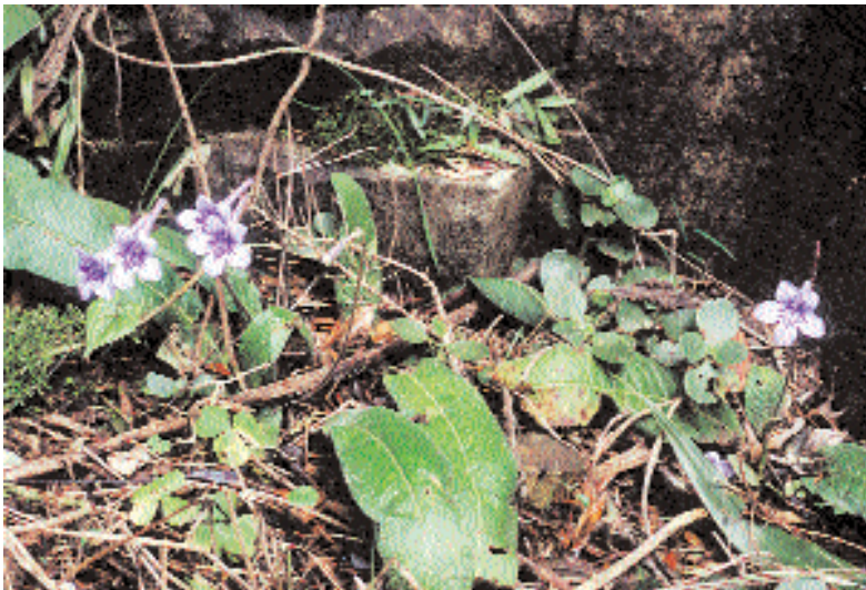
Streptocarpus rexii