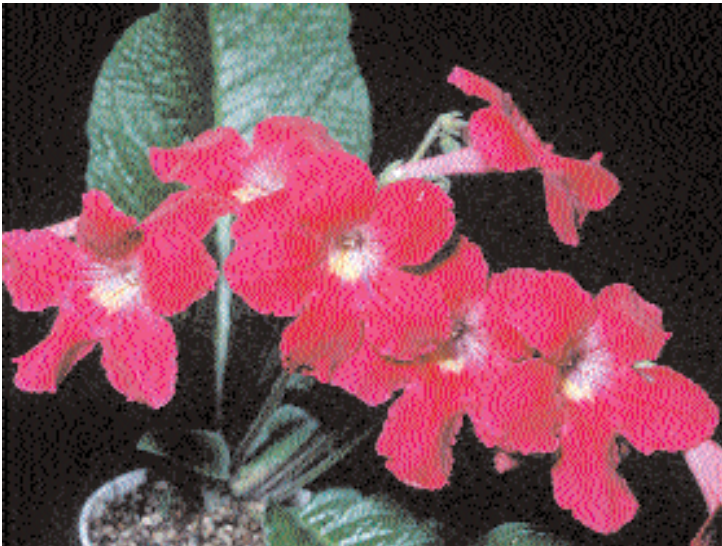
Streptocarpus 'Christmas Morning' IR99589 — Jonathan Ford