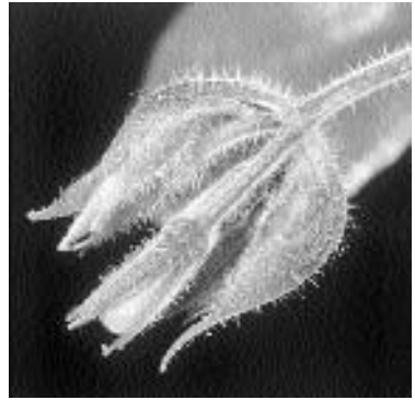
Close-up of flower and inflorescence of Chirita tamiana