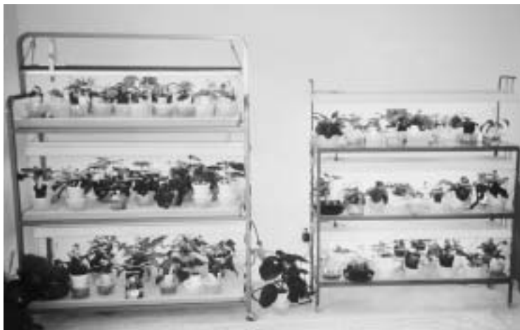
Fluorescent light stands at the home of Dale Martens in Texas

Reflectors and lamp bulbs should be kept clean, keeping in mind that light output weakens with age of the bulb. Lower-light affect can be solved by either replacing the bulb or increasing the duration of light to 14 hours. If