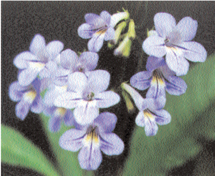
Streptocarpus 'Upstart' IR98554