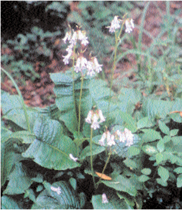
Streptocarpus fanniniae