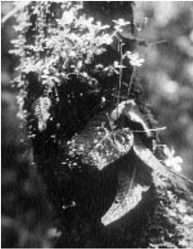
Streptocarpus silvaticus growing high on a tree