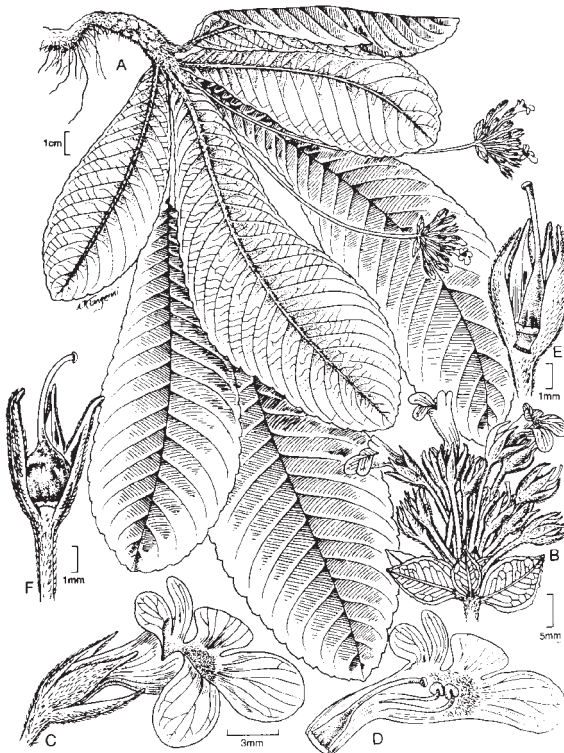
Resia ichthyoides subsp. bracteata illustration from Biollania 1997

The poorly known and rarely collected genus Resia is reviewed. There are two species, R. nimbicola , from Colombia, and R. ichthyoides , previously known only from Venezuela. A new subspecies, R. ichthyoides subsp. bracteata , is described from Colombia. The presence of bracts in this subspecies suggests that the genus Resia does not belong in tribe Beslerieae, which is characterized by lacking bracts. On the basis of this and other characters, the authors suggest that Resia would be better placed in tribe Napeantheae.