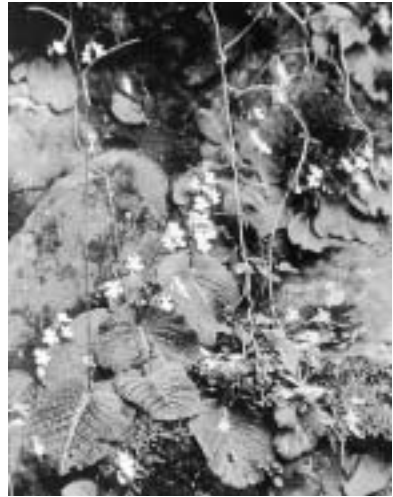
S. penterianus and S. haygarthii growing on cool, moist rocks

crevasses and vertical cliffs. The small S. silvaticus , which is another one of the perennial unifoliates, can usually be found growing on tree trunks up to twelve feet off the ground.