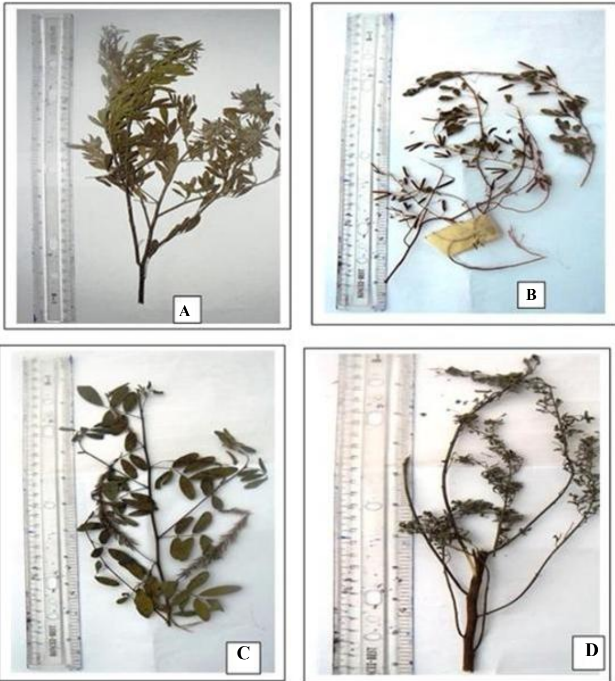
Fig. 1: Photographs of the species of Indigofera studied .