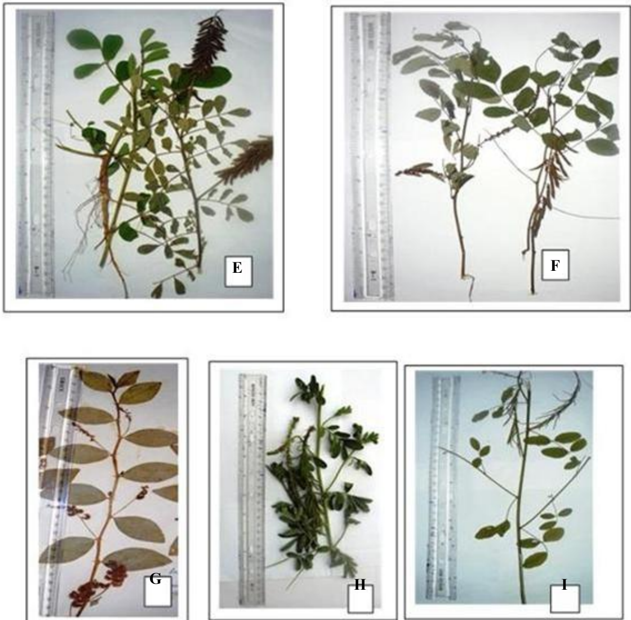
Fig. 2: Photographs of the species of Indigofera studied