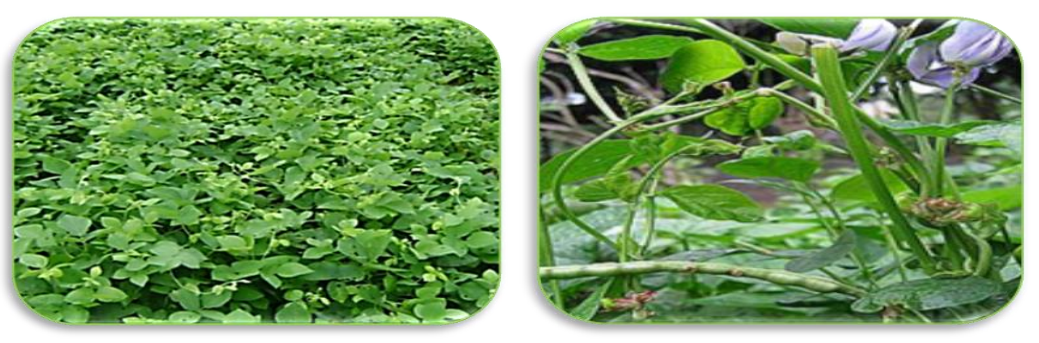
Fig-1: Field view of crop M. uniflorum Plant.