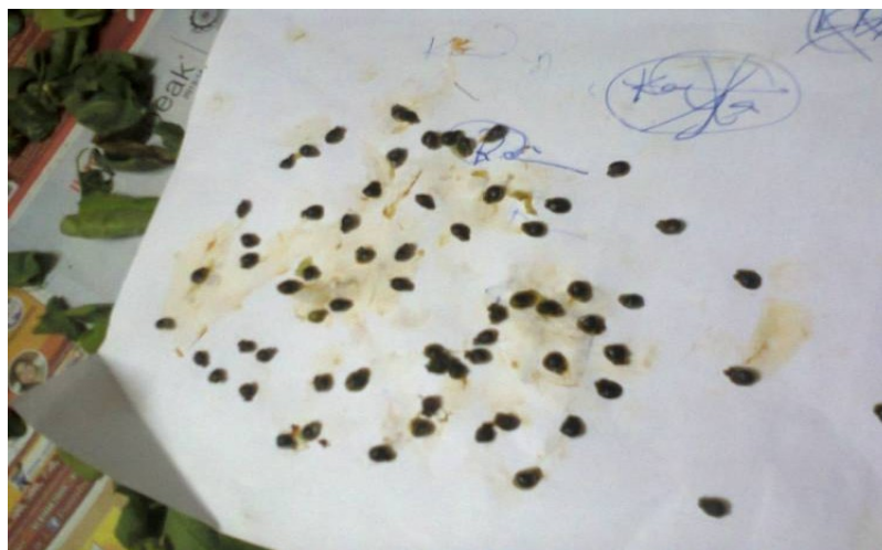
Figure.13 Parts of the Kedrostis foetidissima