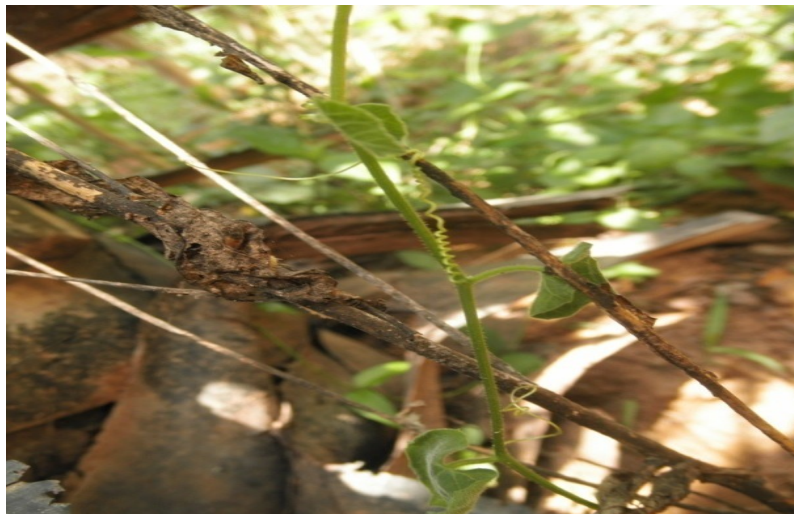
Figure.7 (a) Leaves Kedrostis foetidissima