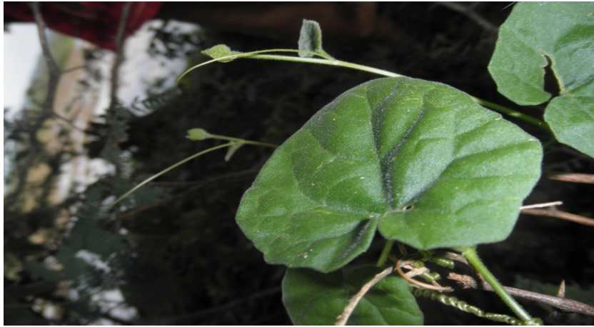
Figure.8 Tendril of Kedrostis foetidissima