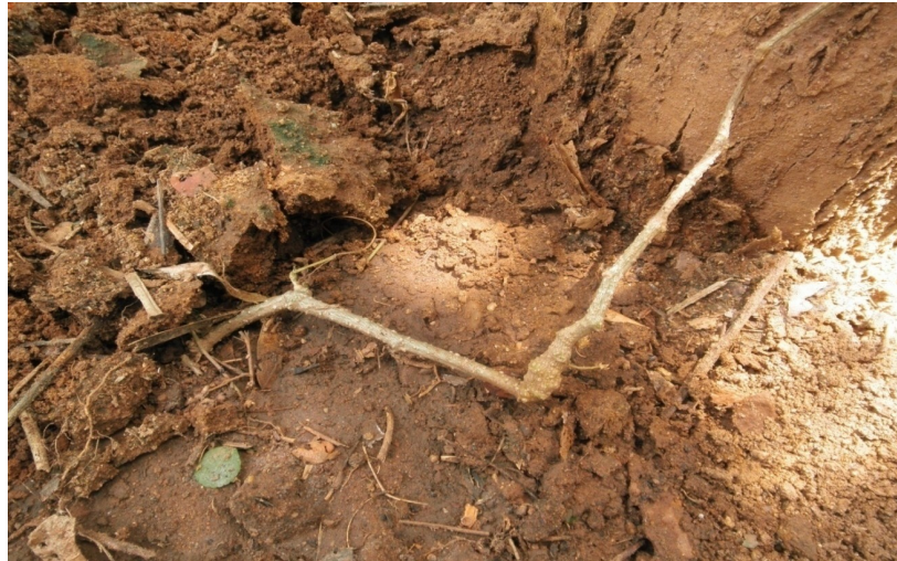
Figure.4 Matured tuber of Kedrostis foetidissima