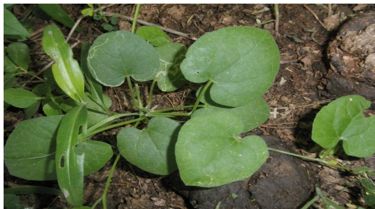
Figure.1 Seedling stage of Kedrostis foetidissima