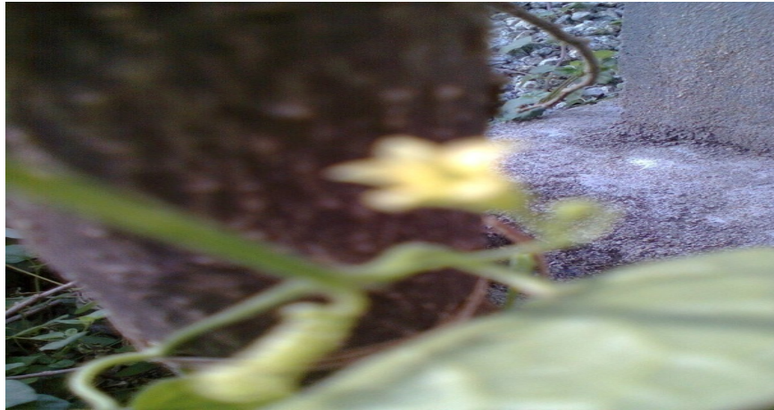
Figure11 Fruits of Kedrostis foetidissima