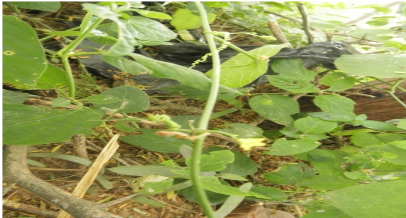
Figure.6 Leaves of Kedrostis foetidissima