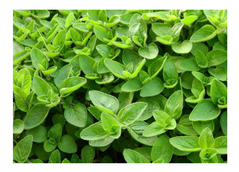
Figure 1: Photo of Origanum majorana L.

Origanum majorana L. used in this work was harvested through a biological culture in Nabeul (Tunisia) in May 2017. The fresh aerial material was dried at room temperature, and then it was milled, and finally stored in a closed container before use.