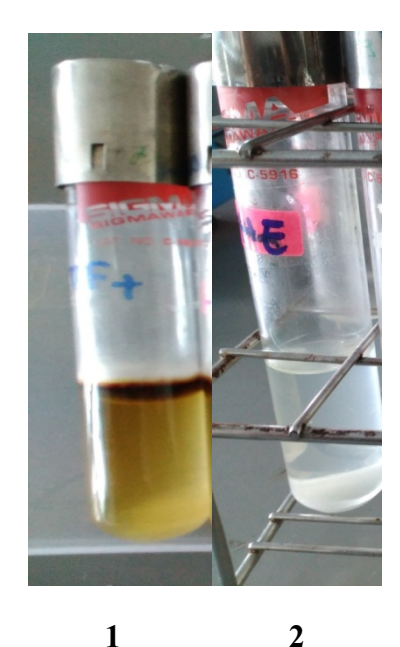
Figure 4: Effect of EO of Origanum majorana L. against biofilm formation of F.oxysporum With; 1: untreated biofilm; 2: response of biofilm in presence of EO

Due to the high activity of EO of Organum marjorna L. against Fusarium oxysporum , the activity against biofilm of this phytopathogen was determined. The Results showed that the EO presents hasa great antibiofilm activity; it was inhibited 100% (Figure 4). The formation of biofilm from fungi plays an important role; it can increase the resistance of antifungal compounds. The results are illustrated in Figure 4. According to the Figure 4, essential oil of Origanum majorana L. has a good inhibition against biofilm of Fusarium oxysporum : the percentage of inhibition was 100% using 100µL compared to untreated biofilm. Works on antibiofilm activity of Fusarium oxysporum are very limited. Referring to the literature EO of some medicinal plants such Thyme and clove inhibited totally the biofilm formation of Fusarium oxysporumat 50 µL [39].