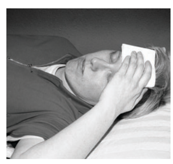
Fig. 4 Linseed poultices. a Preparation. b Application.