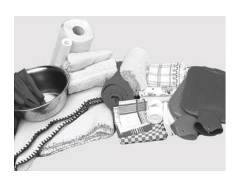
Fig. 2 Recommended wrapping materials. Adapted with permission from A. Sonn, Wickel und Auflagen , Thieme, Stuttgart, 1998.