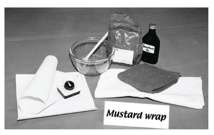
Fig. 5 Materials required for a mustard wrap. Reproduced with permission from A. Sonn, Wickel und Auflagen, Thieme, Stuttgart, 1998.