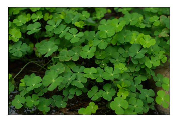
Figure 2. Marsilea minuta plant