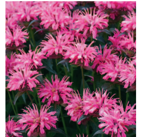
UPSCALE<sup>™</sup> 'Pink Chenille' Monarda USPPAF CanPBRAF

Chartreuse sells, especially in shade plants, and this brilliant hosta has it in spades. In fact, its yellow foliage brightens as the season progresses unlike many hostas of this type which turn green in summer. Like 'Diamond Lake', this low, broadly mounded hosta has similar thick, wedge-shaped leaves with intensely rippled margins. Lavender flowers appear just above the foliage in midsummer. Height: 19" Scape: 18-27" Spread: 42-48" Zones 3-9 Exposure: Part shade to full shade