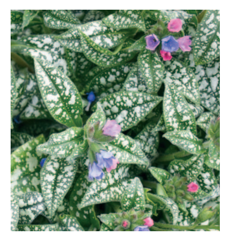
'Pink-a-Blue' Pulmonaria USPPAF CanPBRAF

This unique new cultivar produces some of the longest flower scapes we've ever seen on a Veronica, reaching nearly 12" in length. Icy blue spikes cover the top 2/3 of the plant over the glossy green, mounded foliage beginning in early summer and lasting most of the summer. They elongate for many weeks and shed the spent flowers cleanly as new ones open. Vernalization is required for best flowering performance. Zones: 4-8 Exposure: Full sun to part sun