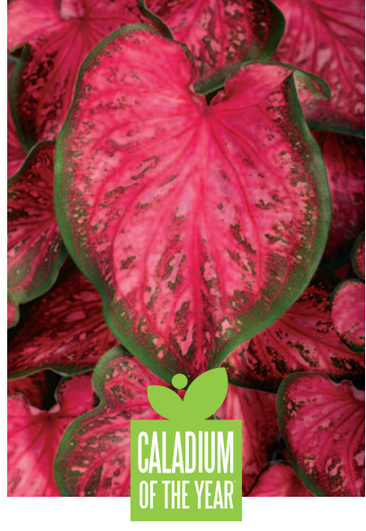
HEART TO HEART® 'Scarlet Flame' Caladium