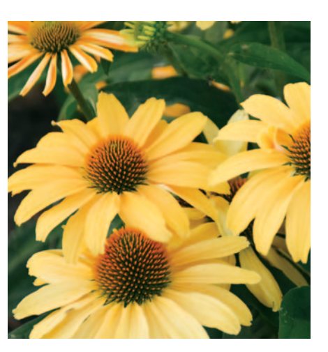
COLOR CODED® 'One in a Melon' Fchinacea USPPAF CanPBRAF

Soft honeydew melon, 4" wide, fully double blossoms with broad, horizontal ray petals appear in abundance from midsummer through late summer. Members of this new series are selected for their prolific production of double flowers atop low, wide, dense rosettes of deep green foliage, allowing for use along the front of the border. A perfect complement to our single-flowered Color Coded coneflowers. Height: 18-20" Spread: 16-18" Zones 4-8 Exposure: Full sun to part sun