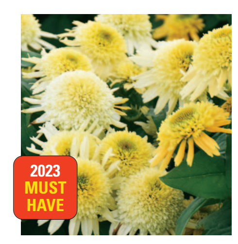
DOUBLE CODED<sup>™</sup> 'Butter Pecan' Echinacea USPPAF CanPBRAF

Height: 20-22" Spread: 16-18" Zones 4-8 Exposure: Full sun to part sun