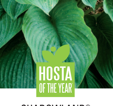
SHADOWLAND® 'Empress Wu' Hosta