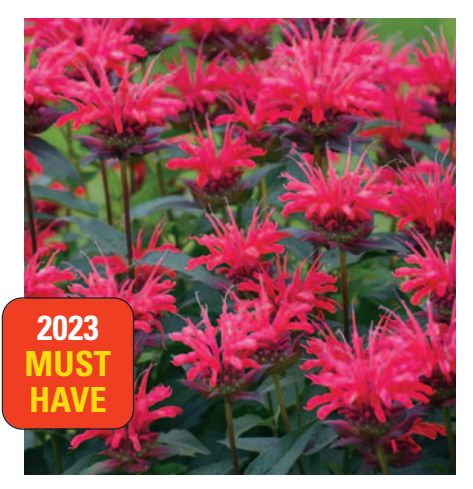
UPSCALE<sup>™</sup> 'Red Velvet' Monarda USPPAF CanPBRAF

This sophisticated blue-green and creamy yellow variegated hosta will catch your customers' attention with its notably rippled margins. It emerges in spring as an energetic mass of ruffled foliage, then matures into a broad, stately mound, bringing terrific texture to the shade garden. Pale lavender flowers attract pollinators from midsummer to late summer. Height: 17" Scape: 24-29" Spread: 46" Zones 3-9 Exposure: Part shade to full shade