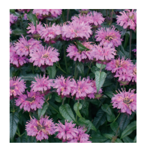
UPSCALE<sup>™</sup> 'Lavender Taffeta' Monarda USPPAF CanPBRAF

This beautiful new addition to our hosta collection is a large, very thick-leafed, cloudy blue selection. Compared to 'Diamond Lake', its leaves have very smooth edges and take on cupped, puckered characteristics as the plant matures. Pale lavender flowers appear in midsummer on proportional scapes above the broadly mounded foliage. Pairs perfectly with our 'Crested Surf' painted fern. Height: 25" Scape: 30-38" Spread: 54-60" Zones 3-9 Exposure: Part shade to full shade