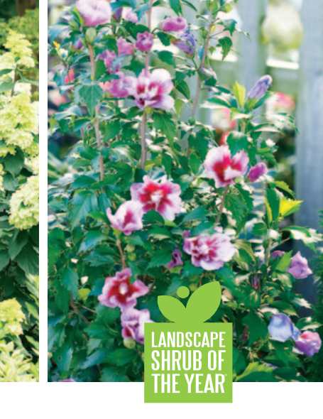
PURPLE PILLAR® Hibiscus