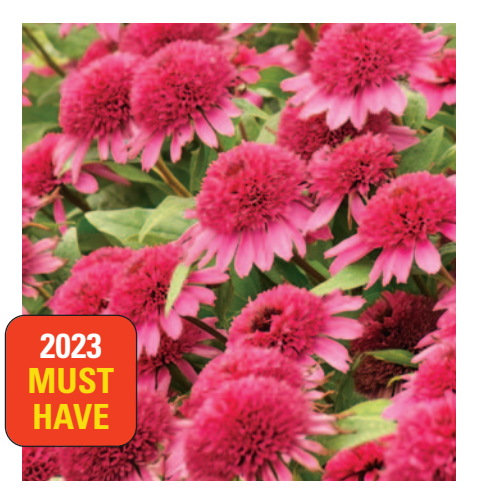
DOUBLE CODED<sup>™</sup> 'Raspberry Beret' Echinacea USPPAF CanPBRAF

Height: 24-26" Spread: 18-20" Zones 4-8 Exposure: Full sun to part sun