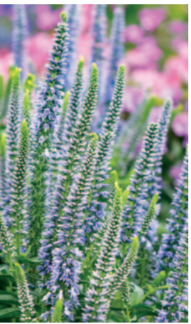
Veronica USPPAF CanPBRAF

This unique new cultivar produces some of the longest flower scapes we've ever seen on a Veronica, reaching nearly 12" in length. Icy blue spikes cover the top 2/3 of the plant over the glossy green, mounded foliage beginning in early summer and lasting most of the summer. They elongate for many weeks and shed the spent flowers cleanly as new ones open. Vernalization is required for best flowering performance. Zones: 4-8 Exposure: Full sun to part sun