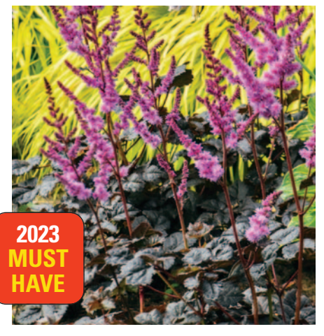
'Darkside of the Moon' Astilbe USPPAF CanPBRAF

Eye-catching rosy purple flowers with burgundy calyxes are produced in abundance on this full, upright Agastache from midsummer to early fall. A deep purple cast on the foliage is a bonus in spring. The perfect color for attracting hummingbirds; use in patio-side plantings. Members of this new collection were selected for their large, robust habit, significant landscape presence and cold hardiness. Zones: 5-9 Exposure: Full sun