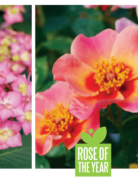
RINGO ALL-STAR<sup>™</sup> Rosa