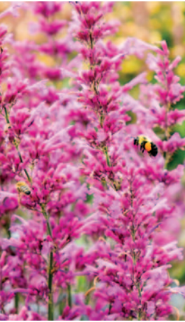
MEANT TO BEE<sup>™</sup> 'Royal Raspberry'

Eye-catching rosy purple flowers with burgundy calyxes are produced in abundance on this full, upright Agastache from midsummer to early fall. A deep purple cast on the foliage is a bonus in spring. The perfect color for attracting hummingbirds; use in patio-side plantings. Members of this new collection were selected for their large, robust habit, significant landscape presence and cold hardiness. Zones: 5-9 Exposure: Full sun