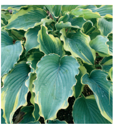
SHADOWLAND® 'Voices in the Wind' Hosta USPP33265 CanPBRAF

Large 3<sup>1</sup>/<sub>2</sub>", two-toned fluorescent and light pink flowers lend a two-tone effect to this floriferous bee balm when it's in bloom from midsummer through late summer. Though it is the shortest of the Upscale series, it is notably taller than 'Pardon My Pink', standing about knee high. Its flowers cover the top half of the healthy, rich green foliage which spreads slowly to create a dense clump. Height: 20-22" Spread: 18-22" Zones 4-8 Exposure: Full sun to part sun