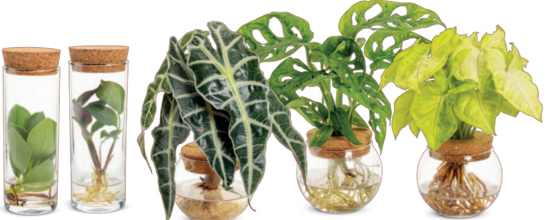
Above, left to right: leafjoy H<sub>2</sub>0<sup>™</sup> Mini Princess Clusia rosea , leafjoy H<sub>2</sub>0<sup>™</sup> Mini Grey Star Ctenanthe setosa , leafjoy H<sub>2</sub>0<sup>™</sup> Bowl Bambino Alocasia. leafiov H<sub>2</sub>O<sup>™</sup> Bowl Friedrichsthalii Monstera adansonii and leafiov H<sub>2</sub>O<sup>™</sup> Bowl Golden Allusion Synaonium

a novice or experienced at growing plants.