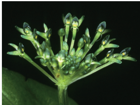
Figure 1. Inflorescence of Malaxis rzedowskiana (from a plant from Guerrero, Mexico: Salazar et al. 6437 , MEXU).