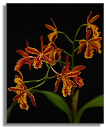
Eplc. Volcano Trick 'Orange Fire' Grower: Pat Randall