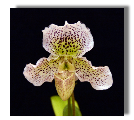
Paphiopedilum Fairly Galaxy Grower: Tracey Thue