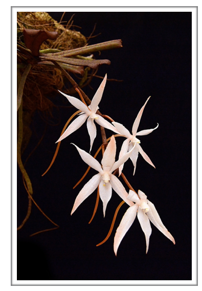
Aerangis kirkii Grower: Calvin Lo