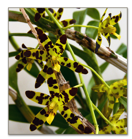
Ansellia africana Grower: Al Hartridge