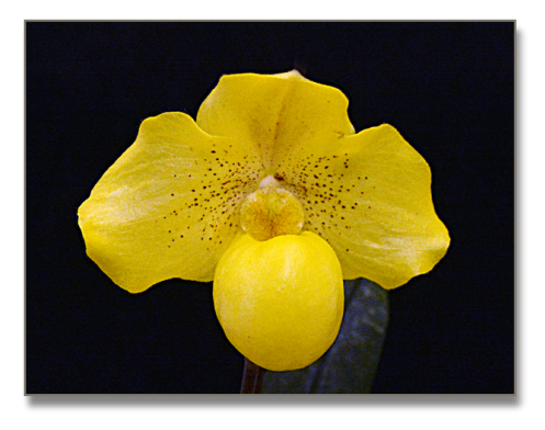
Paphiopedilum Kiryu (armeniacum x godefroyae var leucochilum) Grower: Bob Lucas