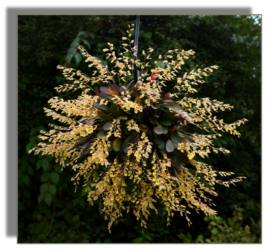
Specklinia grobyi Grower: Tracey Thue