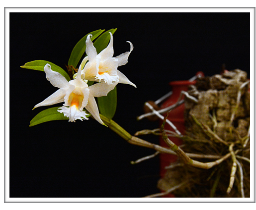
Dendrobium longi-cornu 'Ernie Katler' Grower: Calvin Lo