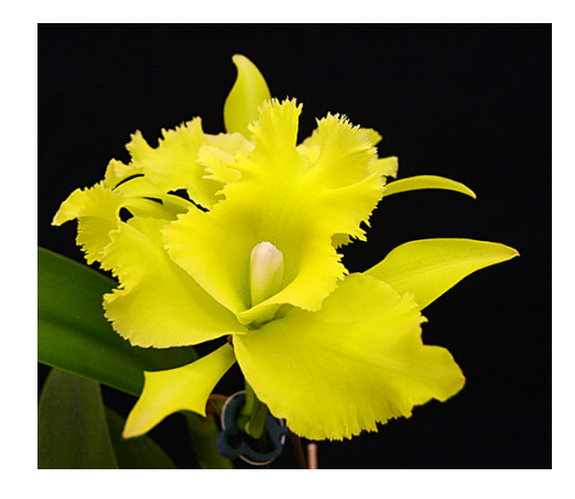
Rbl Ports of Paradise 'Green Ching Hua' AM/AOS Grower: Pat Randall