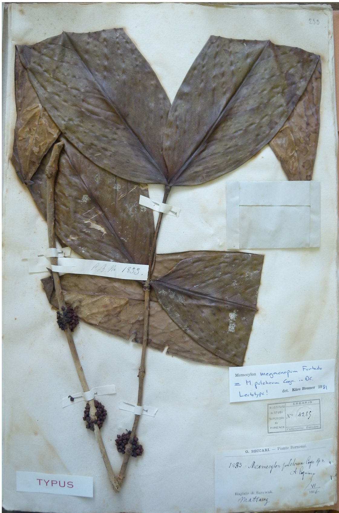
Fig. 1. Image of a syntype of Memecylon megacarpum Furtado [Beccari 1833 (FI)].