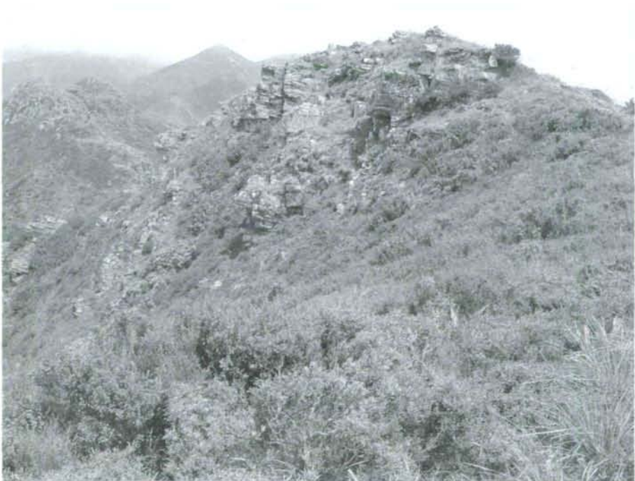
Figs. 1: Type locality of Cypha bifida sp. n.: Sierra de Ancares: peak of Tres Obisbos (Spain: Galicia).